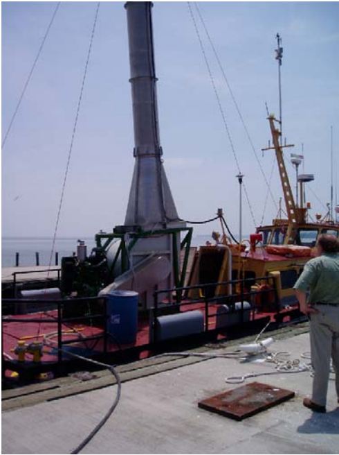
Figure 3 Dispersal Stack and Blower on Simulant release boat Gatlin