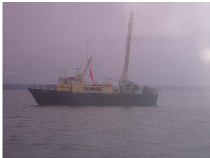
Figure 5. Simulant Release Boat Gatlin operating on the PRTR

The JSLSCAD systems were stationed two on land at the Search and Track Sensor Test Site - Experimental Test Facility (ETF), one on land at the AA Fuse building and one on a boat operating upwind or cross wind from the simulant cloud. IR Cameras were co-located with one of the JSLSCAD units at the ETF, and with the JSLSCAD unit on the Sealion to track the position of the simulant cloud.