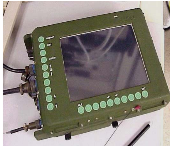
Figure 2 JSLSCAD Operator Display Unit (ODU)