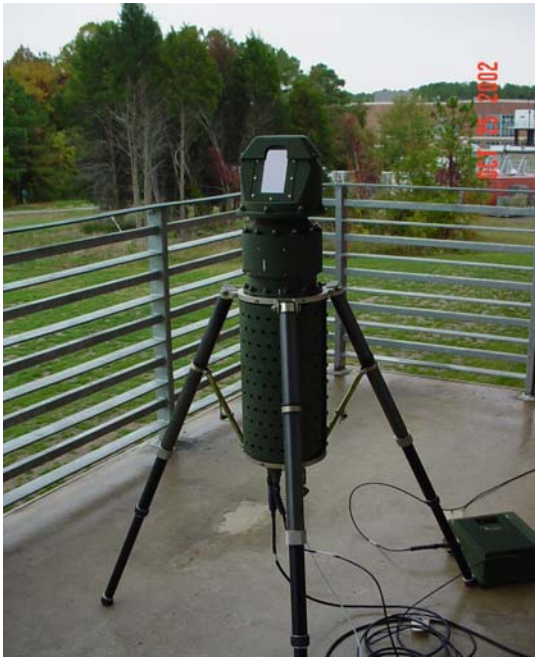
Figure 1 JSLSCAD SEM and Power Adapter (lower right)