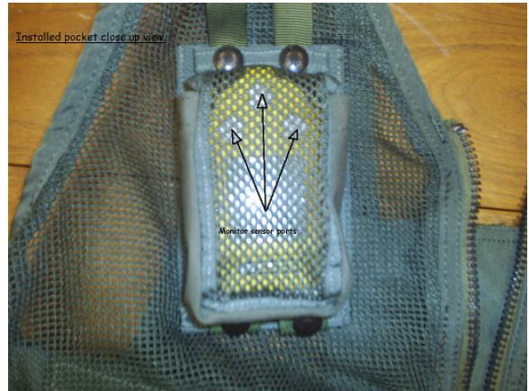
Figure 1 Monitor installed in pocket

collected continuously, and monitors were retrieved post-flight for data download and analysis. At the conclusion of each test, crew members were briefly interviewed by a test-team physiologist and observed for clinical signs of carbon monoxide and/or hydrocarbon exposure.