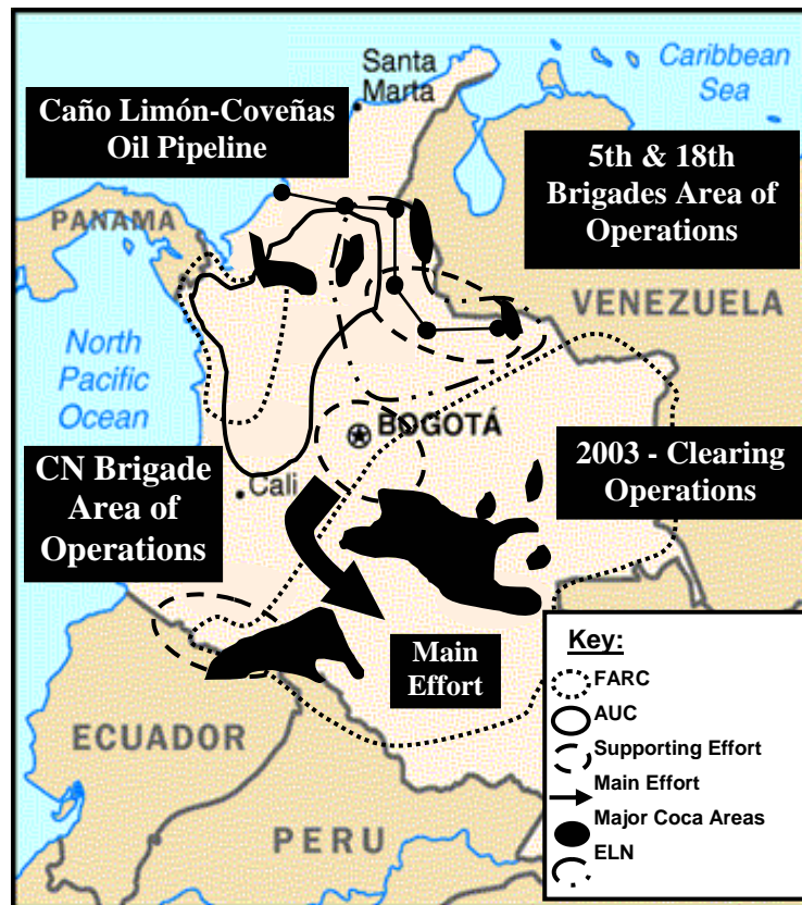
Figure 3. Plan Patriota 51

Meanwhile, in Arauca, the U.S. training of the Colombian 5th Mobile and 18th Infantry Brigades showed dramatic results defending the Caño Limon Oil Pipeline (see Figure 3). Primarily the ELN, but also the FARC, attacked the pipeline a record 170 times in 2001, shutting-down oil-flow all year, with the spills causing an environmental nightmare. Fortunately, throughout 2003, the narco-terrorists were under pressure and only able to muster "...below two dozen..." attacks. 50