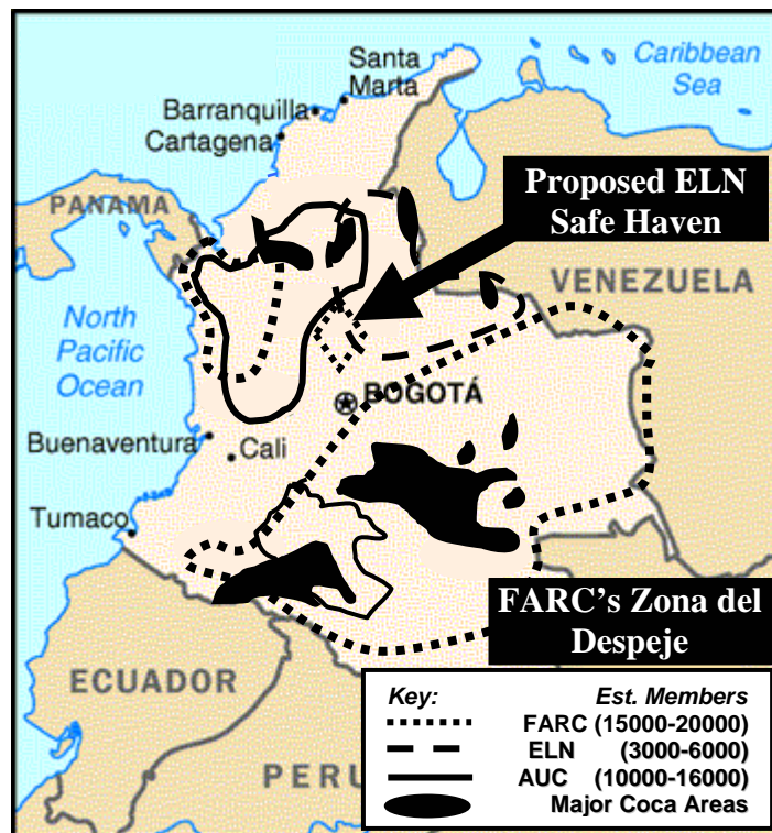
Figure 1. Areas of Greatest Enemy Activity in 2001 1