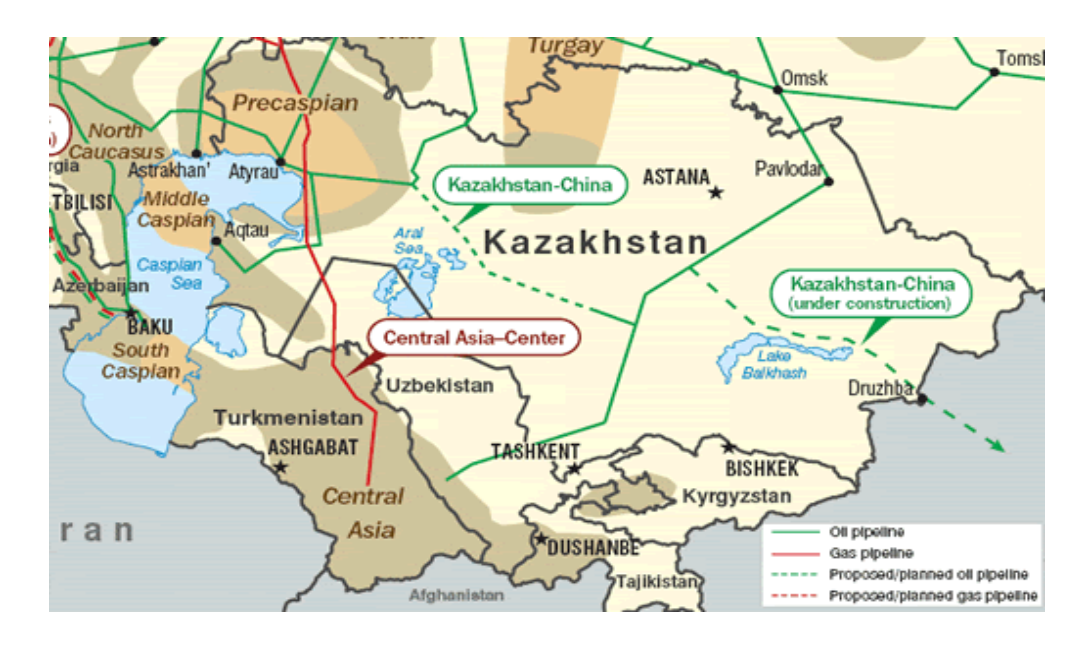
Figure 1. Central Asia Pipelines. (Energy Information Administration, US Dept. of Energy)

Turkmenistan, Central Asia's primary gas exporter signed a deal with Gazprom in 2003, agreeing to a 25-year contract to sell all the gas it produces at discount price to Russia for export. Russia uses part of the Turkmen gas domestically and sells the excess to Eastern Europe and CIS countries at a mark up. Just over a year later however, volatile Turkmenistan leader Saparmurat Niyazov cut off supplies and tried to renegotiate more favorable terms. <sup>226</sup> When Moscow balked, Ukraine tried to cut the same deal, and capture the European market for itself, versus being merely a transit conduit for Gazprom's export. Newly elected President Viktor Yushchenko arranged a long term contract for Turkmenistan gas to be exported through Ukraine to Europe but Gazprom responded with a counter offer to Turkmenistan. It insisted it would still pay the previously agreed upon discount price, but offered full payment in cash instead of a 50% barter / cash split. While Niyazov appeared eager to cash in on the European gas mark ups through higher purchase prices from Ukraine, he was forced to acknowledge that he first needed to consult with Russia. Turkmenistan's bargaining position with respect to securing higher prices for its gas is fundamentally weakened by its lack of export options. Except for one pipeline connecting Turkmenistan and Iran, the CAC that