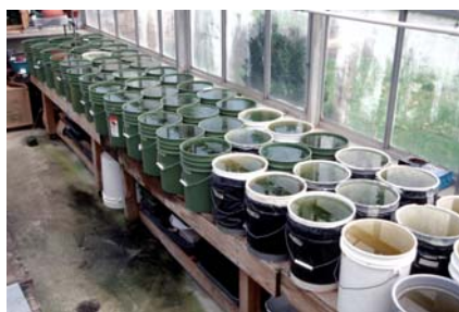
Figure 17. Stuckenia pectinatus plants are grown in buckets to produce turions that can be used in field restoration projects

IMPORTANT CONSIDERATIONS FOR PLANNING: Since submerged aquatic plants are important components of many shallow-water aquatic ecosystems, restoration of these plant communities has been a major focus in many areas, particularly in the Chesapeake Bay. In some cases, restoration projects have been limited by a lack of available planting stock, and concerns regarding potential impacts to donor beds of wild stock. Micropropagation systems offer a number of advantages, including the cost-effective production of virtually unlimited numbers of healthy plants without the seasonal constraints associated with other sources of plant material. However, there are also some limitations that should be considered when making decisions regarding sources of plant stock.