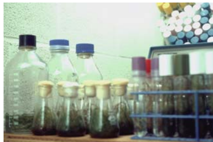
Figure 5. The process of subculturing new plants from axenic cultures can occur in a variety of culture vessels