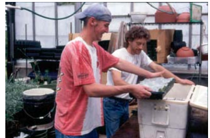
Figure 10. Submersed aquatic angiosperms lack mechanical and water conservation tissues, which makes them vulnerable to physical damage and desiccation. Insulated coolers are a convenient method of protecting plants during their transport to field locations