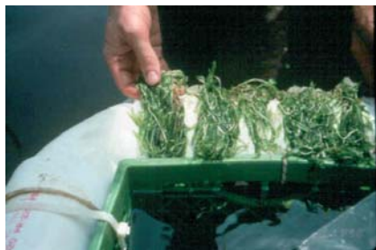
Figure 11. Plants can be taken directly from micropropagation culture systems as bare root transplants