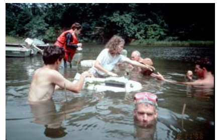
Figure 13. Field restorations in the mid-Chesapeake Bay are frequently conducted on fine sediments in 0.25-1.0 m of water. Disturbance of sediments coupled with natural turbidity in these environments limits visibility. Large numbers of volunteers are often used to compensate for the loss of efficiency and to reduce restoration costs

The interpretation of plant dose/response experiments can be challenging, however (Hall et al 1996, Johnson and Bird 1995). The most common endpoints in dose response experiments involving animals are mortality, biomass, consumption, and morphology (American Society for Testing and Materials (ASTM) 1997, Siesko et al. 1997). These are not necessarily convenient or useful endpoints for assessing