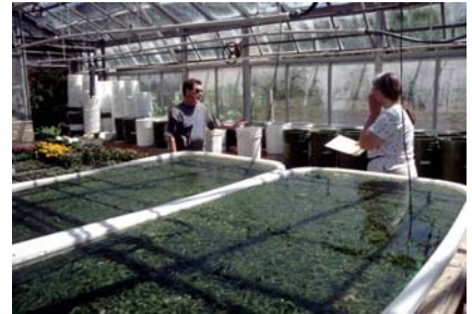
Figure 9. Greenhouse aquaculture system for production of containerized transplants