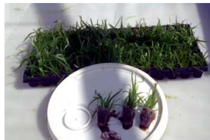
Figure 12. Containerized transplants are separated and prepared for planting