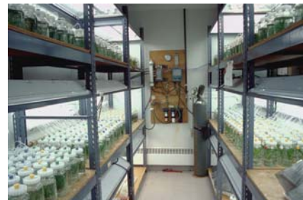
Figure 6. Production from micropropagation systems is exponential and can be adjusted to produce plants in virtually unlimited quantities