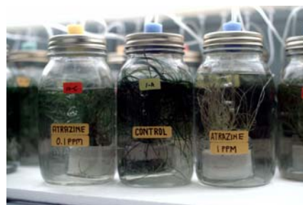
Figure 15. Endpoints to evaluate the effects of physical and chemical environmental factors through dose/response experiments must be selected to accommodate the metabolism of the plant being evaluated

Bioassay systems. Micropropagation can provide large numbers of healthy, undamaged plants to assess ecosystem health. These plants can be placed in natural environments to determine whether or not the ambient conditions will allow the plants to survive, or how well they grow relative to other sites or conditions. Alternatively, sediments and water can be collected from natural environments and used in the lab to incubate plants and assess growth. However, caution must be exercised to avoid using their growth responses to make generalizations about environmental quality, especially with respect to sediment-borne contaminants and toxic compounds. The characteristics of sediments that favor the accumulation of many chemicals are also those that favor the accumulation of essential plant nutrients. Thus, suppression of growth by contaminants could be masked due to the stimulus provided by high concentrations of nutrients.