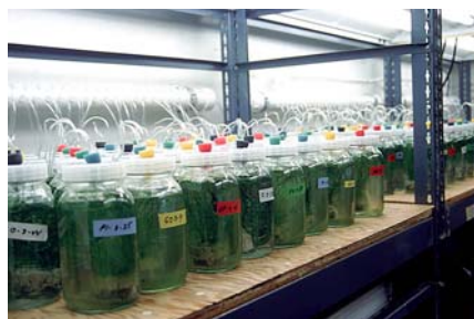
Figure 14. Axenic plant cultures are highly controlled systems that can be exploited for measuring the effects of parameters, like herbicide concentration, on plant growth