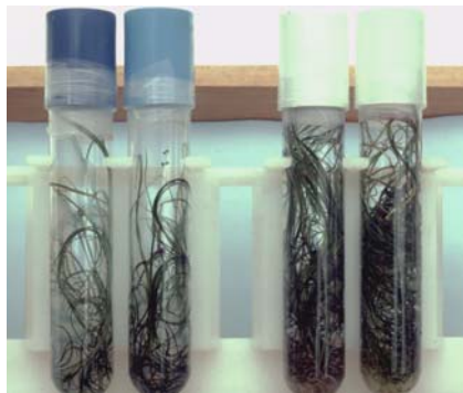
Figure 4. Once a positive growth response is obtained, the process of media refinement is facilitated