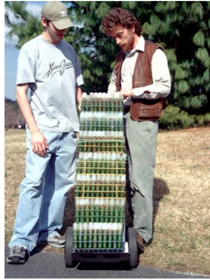
Figure 8. Plants can be transported to greenhouse aquaculture systems for further growth