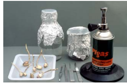
Figure 3. Removal of living contaminants like bacteria and fungi is achieved by exposure to surface sterilants, antibiotics, and fungicides in a sterile working environment under a laminar flow hood