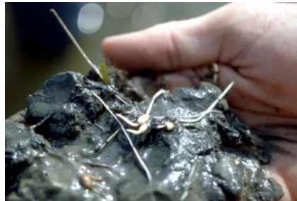
Figure 2. Turions of sago pondweed have protected meristems that are prime sources of initial material for disinfections of living contaminants prior to culture