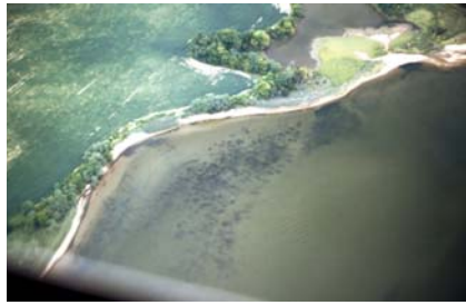
Figure 1. Stock selected for micropropagation should exhibit desirable qualities such as stress resistance, vigor, environmental persistence, or other traits that impart plant hardiness under ambient field conditions

for field establishment. The process used to produce sago pondweed ( Stuckenia pectinatus ; syn. Potamogeton pectinatus ) is summarized in Figures 1-6.