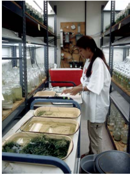
Figure 7. Plants produced in micropropagation systems can be harvested directly for use in field restoration projects

plants can be expressed as the effective concentration or the lethal concentration in units of plant biomass. Taken collectively, these types of experiments have been shown to accurately identify the effects of ambient environmental conditions on plant growth because plant responses do not need to be interpreted based on the influences of other organisms that might be present.