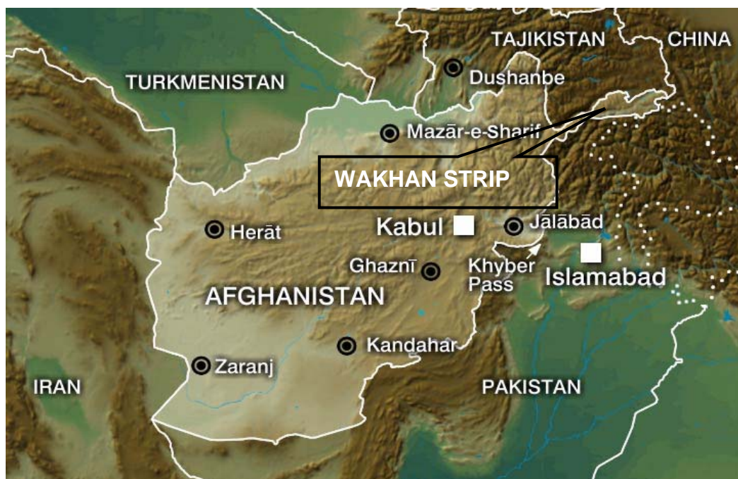
Figure 4. Northern and Western borders of Afghanistan and Wakhan Corridor. 44

The Forward policy meant control of natural frontiers. This policy was aimed at the physical occupation and direct administration of the area. It was formulated against the backdrop of Russian advancement, which challenged British supremacy in south Asia and demanded recognition of the need to defend India. Different viewpoints were expressed about how far west and north the British should go: the river Oxus line, the Hindukush line or the Kabul-Ghazni-Kandhar line. It was the last which the British decided to occupy in case of Russian moves towards India. 43