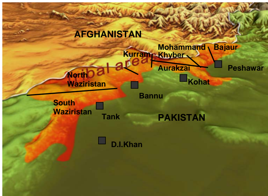
Figure 1. Tribal Areas: Federal and Provincial Tribal Areas 11

Waziristan) and five Frontier Regions (FR) (Peshawar, Kohat, Bannu, Dera Ismail Khan, and Tank) with a total area 6 of 27,220 square kilometers (larger than the American state of Vermont, with 24,903 square kilometers, and smaller than Maryland, with 31,849 square kilometers). 7 After the creation of Pakistan only three new agencies were created 8 : Mohmand in 1951, and Bajaur and Orakzai in 1973. 9 The tribal areas have a population of 3.7 million, according to the 1998 national census. 10 The governor of NWFP acts as executive head of FATA on behalf of the federal government.