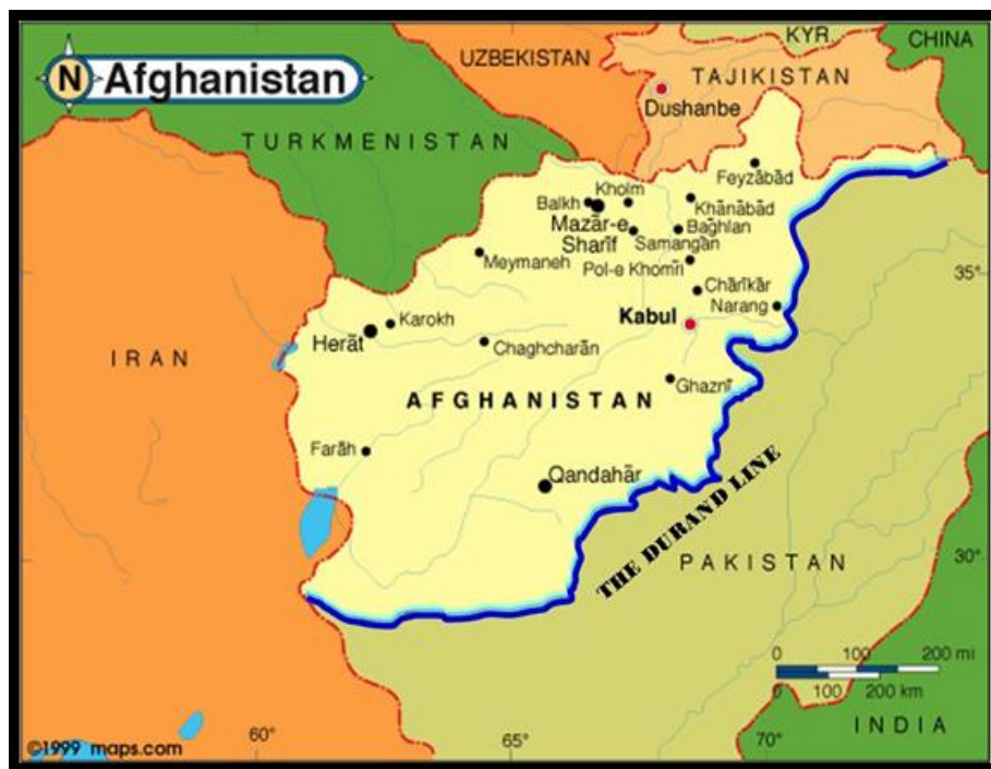
Figure 2. The Durand Line: Western Frontier of Pakistan 14 .

FATA is geographically part of Pakistan, but difficult to govern. For centuries the tribal people have resisted invading armies and have maintained self-rule based on local traditions and values. This study provides an analysis of how the semiautonomous tribal areas can be gradually absorbed into Pakistan while offering a strategy to solve administrative, political, and economic problems so the government may establish its writ in the tribal areas and FATA can play a major role in the future of the nation.