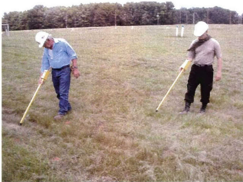
Figure 1. Demonstrator’s system, Magnetometer Schonstedt/hand held.

Schonstedt Magnetometers do not require calibration. They have a simple battery function test and a “Go”/“No Go” field operational check. The magnetometers will be set in accordance with the manufacturer’s handbook to the sensitivity required to detect subsurface anomalies on the project site.