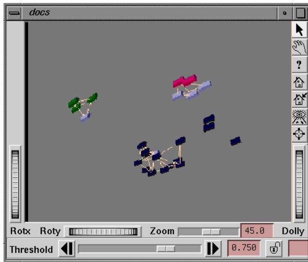
Figure 2. The 3-D Window

dimensional space (approximately 400,000 for this collection) where each dimension corresponds to a feature in the collection and the distance was measured by the sine of the angle between the vectors. That space was collapsed to 3 dimensions for visualization using a spring embedding algorithm[12]. The interface included a slider for adjusting the threshold that determined the tightness of the generated clusters. The resulting visualization is similar in style to BEAD[4], differing in a few key aspects: BEAD was used on an entire (though small) corpus, and this display is used only on the retrieved set; the vectors used by BEAD were based on document abstracts but the vectors used by this display are based on full text.