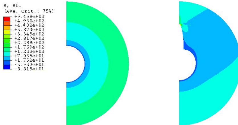
Figure 3: Stress Fields in Uncracked and Cracked Thermal Analog Motors (Case Not Shown)