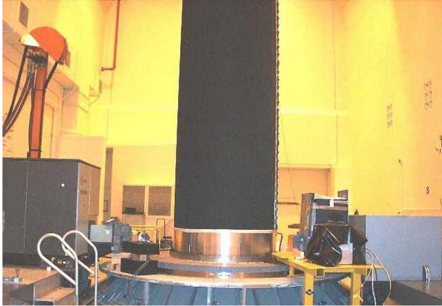
Figure 2: Hill AFB High Resolution 3D Computed Tomography (HR3DCT) Facility Inspecting Large Steel Case Boost Motor

needs to be brought back to the depot for other maintenance. A photograph of the computed tomography facility at Hill AFB with a prototype high resolution imager is shown in Figure 2.