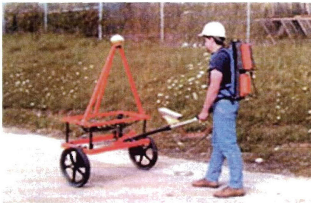
Figure 1. Demonstrator's system, EM61-MKII/pushcart.

Parsons will mobilize two, two-man EM crews to APG with a geophysicist, and safely locate detectable anomalies using electromagnetic systems (Geonics EM61-MKII) within the Standardized UXO Technology Demonstration Site at APG, including the Blind Grid (0.48 acres), Open Field (13.68 acres), Moguls (1.3 acres), and Wooded (1.35 acres) areas, but not including the Active Response Area (3.5 acres) (fig. 1). As each anomaly is detected, its location will be marked by a pin flag.