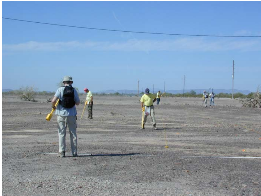
Figure 1. Demonstrator’s system, Magnetometer Schonstedt/hand held.

Parsons will safely locate and flag detectable magnetic anomalies using hand-held magnetometers (Schonstedt) within the Standardized UXO Technology Demonstration Site at APG, including the Blind Grid (.48 acres), Open Field (13.68 acres), Moguls (1.3 acres), and Woods (1.35 acres), but not including performance the Active Response Area (3.5 acres). As each anomaly is detected, its location will be marked by a pin flag (fig. 1).