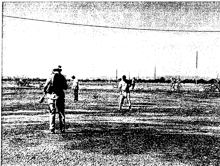
Figure 1. Demonstrator's system, magnetometer schonstedt/hand held.