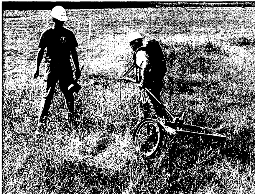
Figure 1. Demonstrator's system, EM61/pushcart.

Parsons will mobilize two, two-man EM crews to APG with a geophysicist, and safely locate detectable anomalies using electromagnetic systems (Geonics EM61-MKII) (fig.1) within the Standardized UXO Technology Demonstration Site at APG, including the Blind Grid (0.48 acres), Open Field (13.68 acres), Moguls (1.3 acres), and Wooded (1.35 acres) areas, but not including the Active Response Area (3.5 acres). As each anomaly is detected, its location will be marked by a pin flag.