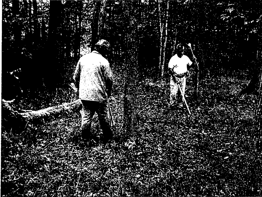
Figure 1. Demonstrator's system, Magnetometer Schonstedt/hand held.