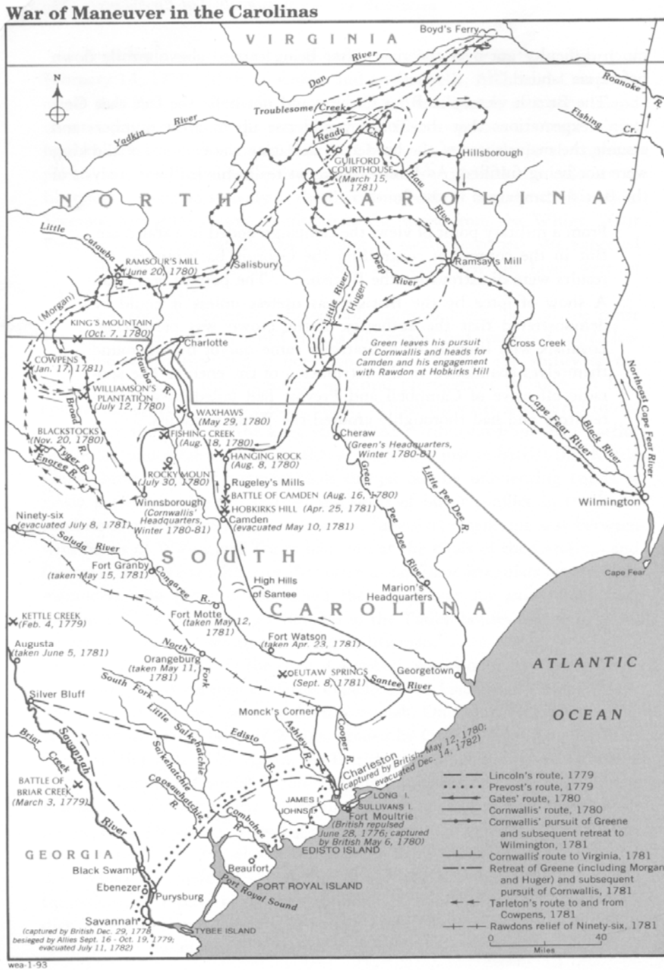
Figure 1. War of Maneuver in the Carolinas