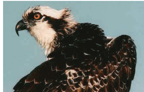
Figure 1. Osprey

The osprey (Figure 1) is one of four raptor species included in a series of Engineer Research and Development Center (ERDC) technical notes produced under the Ecosystem Management and Restoration Research Program (EMRRP). These technical notes (ERDC TN-EMRRP-SI-(12-15)) identify riparian species potentially impacted by U.S. Army Corps of Engineers (Corps) reservoir operations. For management purposes, these raptors are considered riparian generalists because they inhabit riparian zones surrounding streams and lakes on Corps project lands but may seasonally use adjacent transitional and upland habitats. The other raptors in this grouping are the bald eagle ( Haliaeetus leucocephalus ), peregrine falcon ( Falco peregrinus ), and red-shouldered hawk ( Buteo lineatus ), each of which is discussed in a technical note describing the ecology, legal status, potential impacts, and management guidelines for the species. These technical notes are products of the EMRRP work unit entitled “Reservoir Operations - Impacts on Habitats of Target Species” and are linked to ERDC TN-EMRRP-SI-11, which describes the function of the work unit and the general status, impacts, recovery, and management of these four riparian raptors on Corps projects.