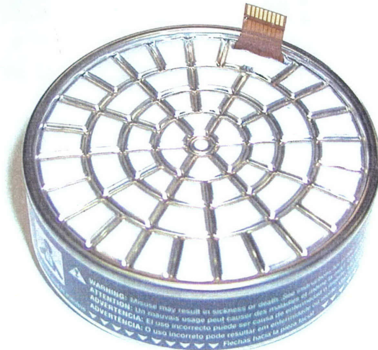
Figure 3. The sensor array embedded into a filter cartridge.

In addition, NPPTL has an ongoing research program with Carnegie Mellon University to develop low cost, multi-modality sensors. The chemical sensors are being developed using chemically sensitive nanostructured polymers with complimentary metal-oxide semiconductor (CMOS) technologies and microelectromechanical systems (MEMS). A variety of semiconductive regioregular polythiophenes-based polymers and block copolymers have been synthesized. Novel coating methods are being explored. The sensors have been designed to detect conductivity, gravimetric, and stress changes in the polymers in response to gas analyte exposure. [Fedder, 2004]