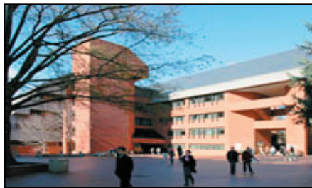
The Intercultural Center at Georgetown University

The exercise is a scenario-driven negotiations exercise focused on coalition building. Participants are divided into seven teams representing the Ministries of Defense of nations with competing interests in the Caucasus region. A control team provided the scenario drivers and played other regional and international actors.