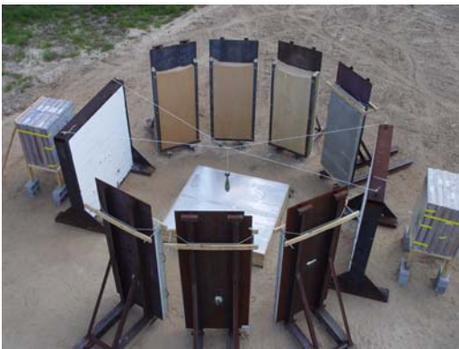
Figure 2. Arena test to evaluate fragment penetration resistance

Shortly following validation of the steel protective structure, a series of arena experiments were conducted at Fort Polk to evaluate the fragment penetration resistance of various materials. Included in the experiments were soil bin walls (retrofitted and unretrofitted), concrete masonry unit walls (retrofitted and unretrofitted), ballistic armors, high performance concrete, conventional reinforced concrete and steel. As with the structure validation, an array of threat weapons was used. From the experimental results, threshold material thicknesses required to defeat the effects of each weapon were identified. This information has been included in an executive summary of experimental findings, and has been transmitted to forward forces. The information is also being used to assist in defining requirements for the other parametric evaluations. A typical arena experiment is shown in Figure 2.