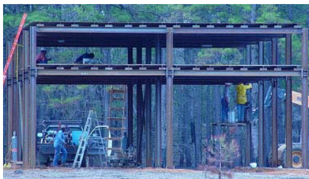
Figure 1. Full-scale prototype structure

Based on guidance received from forward forces, in February 2004, ERDC and PDC collaboratively developed and validated a steel protective structure. The structure was designed to be self-supportive, and would be implemented as a retrofit over the existing trailers. A full-scale prototype was constructed and validated at Fort Polk, LA. During this experiment, the structure's performance against an array of statically detonated threats (including light mortars and rockets) was validated. Upon completion, the experimental results and complete construction drawings were immediately forwarded to in-theatre forces. The validation structure is shown in Figure 1.