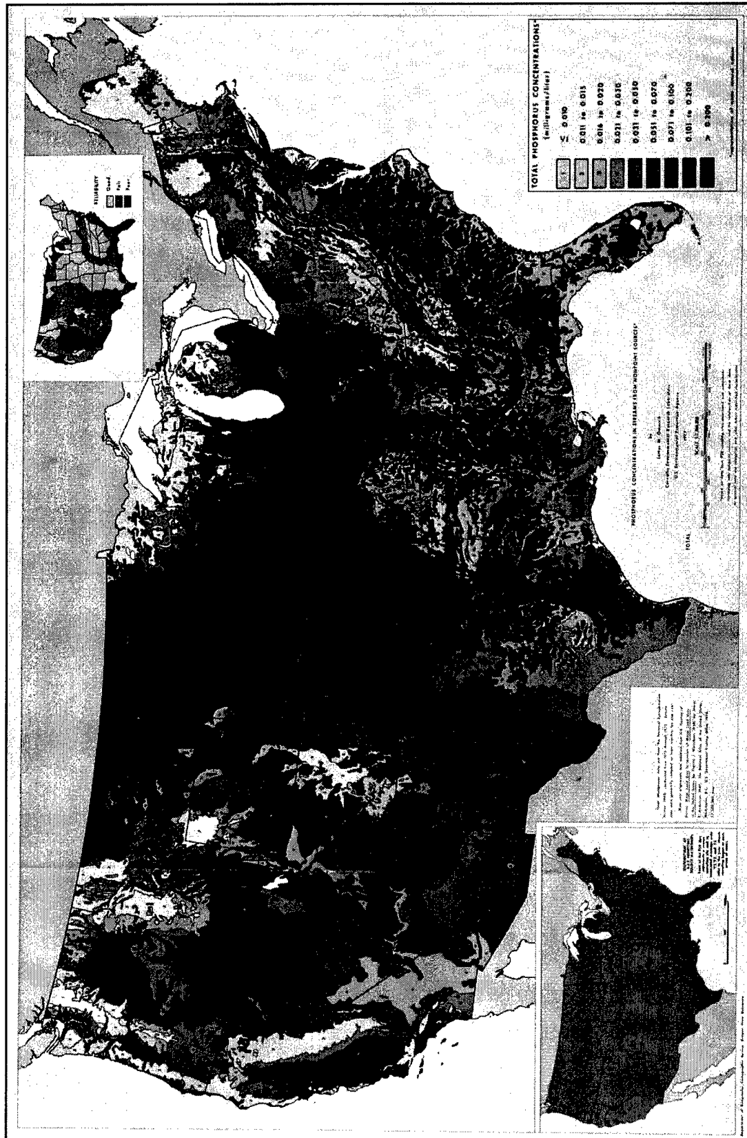
Figure 1. Total phosphorus concentrations in streams from non-point sources across the United States (reprinted from Omernick 1977)