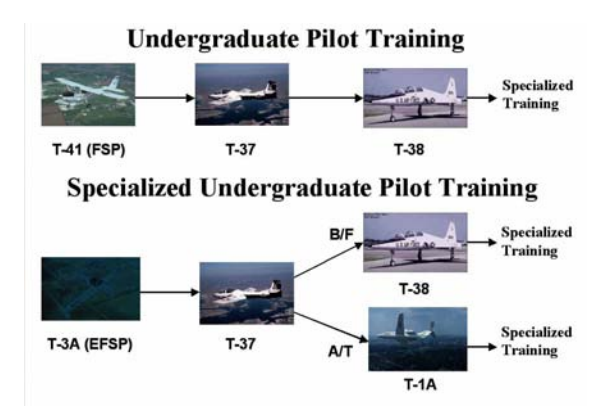
Figure 1. UPT and SUPT Pipelines

specialized training assignments in either tanker-transport-bomber (TTB) aircraft or fighterattack-reconnaissance (FAR) air-craft. Specialized training assignments were based on instructor recommendations, student preferences, and aircraft availability.