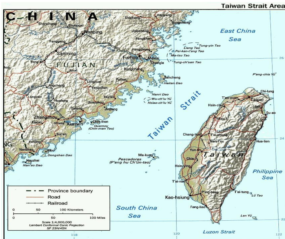
Figure 1. Federation of American Scientists, www.fas.org/man/dod-101/taiwan-geo.htm . Accessed on November 10, 2004.

The current conflict between the Republic of China (ROC) on Taiwan, and People's Republic of China (PRC) began approximately 80 years ago as a struggle for power between the Nationalist Party and Communist Parties within the territories of mainland China. After the Civil War temporarily ended in 1949, the Nationalists flew to Taiwan, while the Communists established authority in mainland China. Since then, a country that shares the same culture, languages, and ancestry, is divided not only geographically by a cold and narrow Taiwan Strait but also politically, into two regimes based on the ideologies of differing political systems (See Figure 1 for a map of this area).