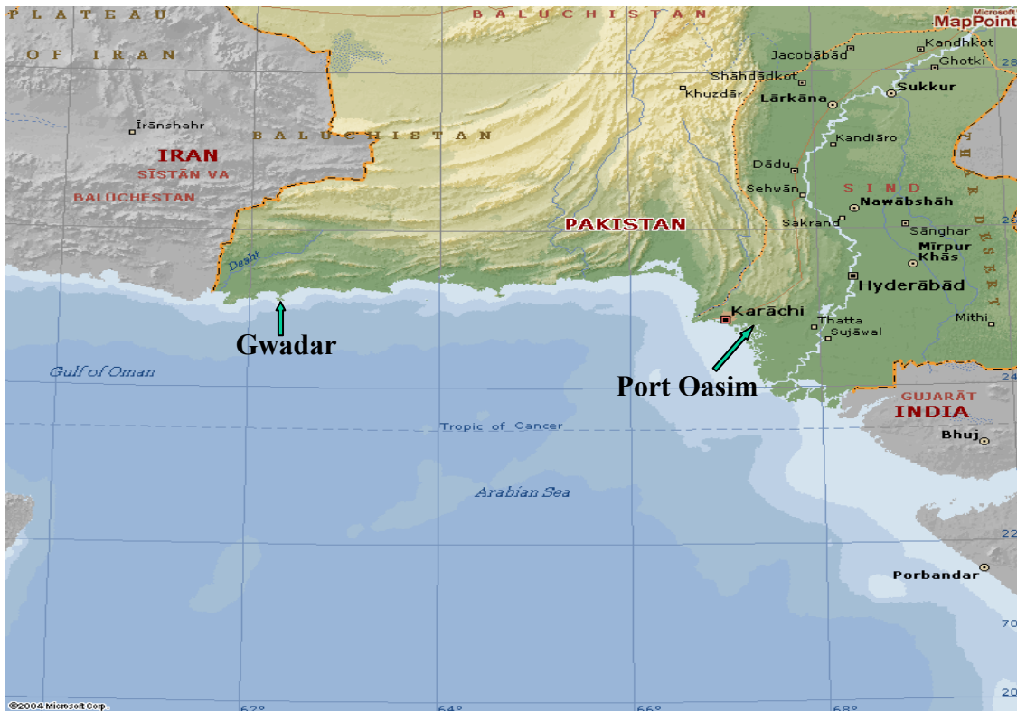
Figure 1: Coastal Map of Pakistan

There is, however, a glimmer of hope, which reflects the strategic shift in thinking of policymakers in Pakistan and a probable reversal of long endured neglect of the maritime sector. Construction of a deep-sea port at Gwadar, and introduction of business friendly policies for revival of shipping industry and exploitation of offshore resources are a few examples in this regard.