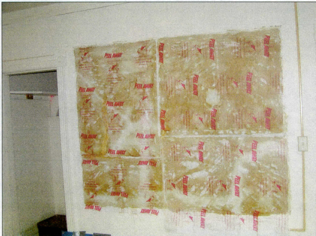
Figure 2. Membrane cover over stripper paste to retain moisture.