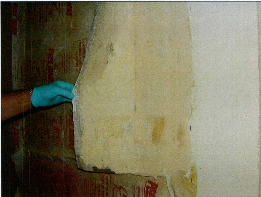
Figure 3. Peeling off membrane and loosened paint.