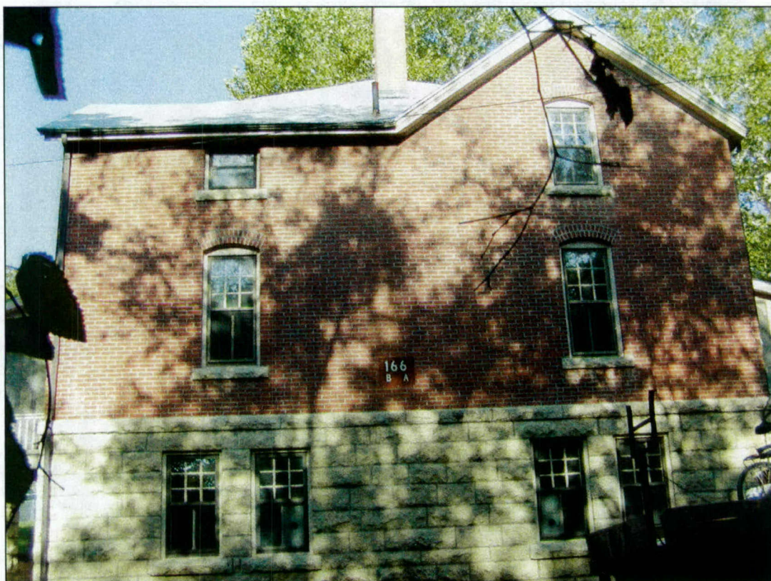
Figure 6. Building 166A/B at Ft. Riley, KS.