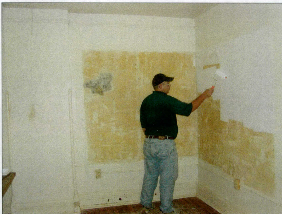
Figure 5. Repainting the stripped area.

UFGS-13281A Lead Hazard Control Activities provides details on health, safety, and environmental requirements for lead hazard control activities. The primary requirements are accident prevention planning, medical surveillance, respiratory protection, training, sampling and analysis, clearance testing, personal protective equipment, hygiene facilities, posted warnings and notices, work procedures, and hazardous waste.