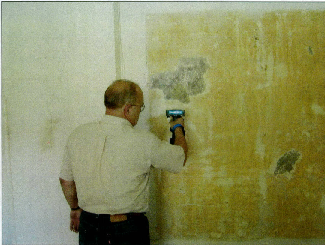
Figure 7. XRF testing for residual lead on stripped plaster wall.