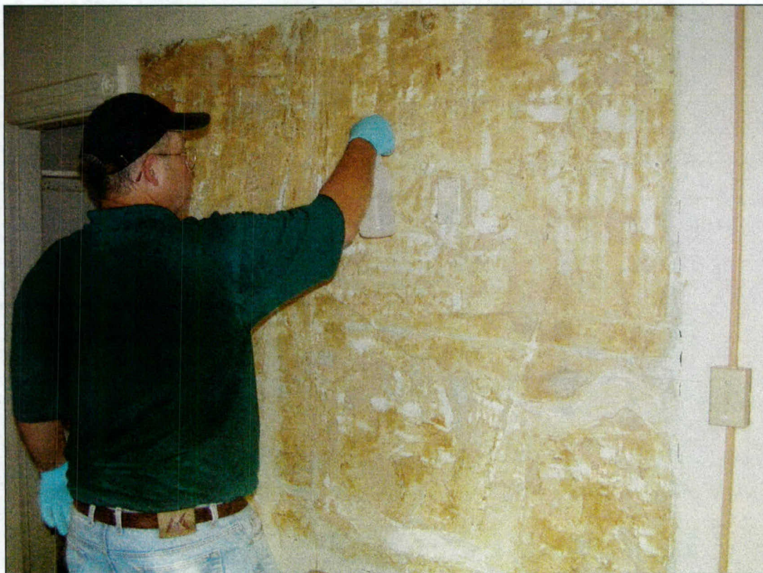
Figure 4. Acid neutralization of the surface after paint removal.