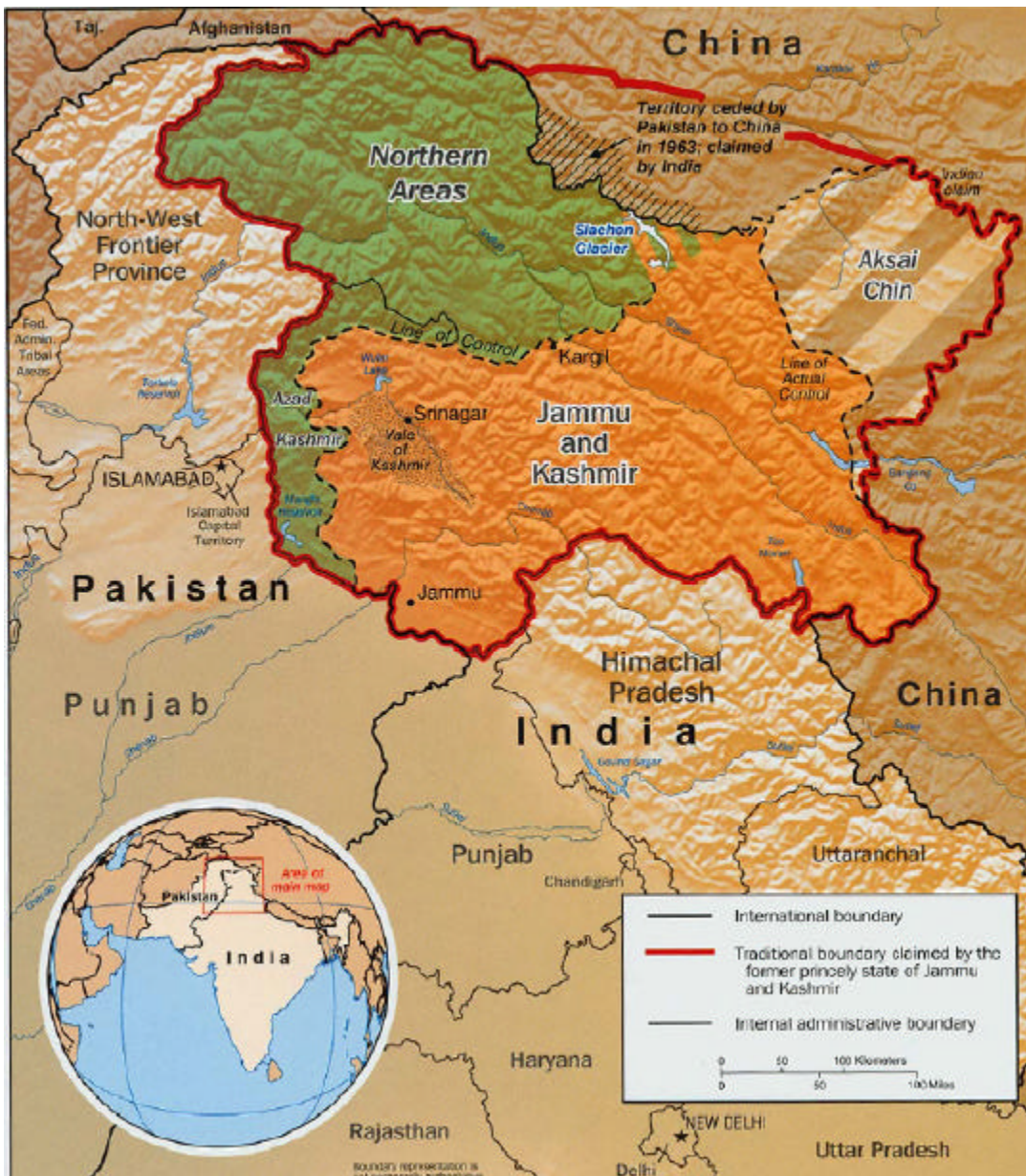
Figure 1. Map of Kashmir