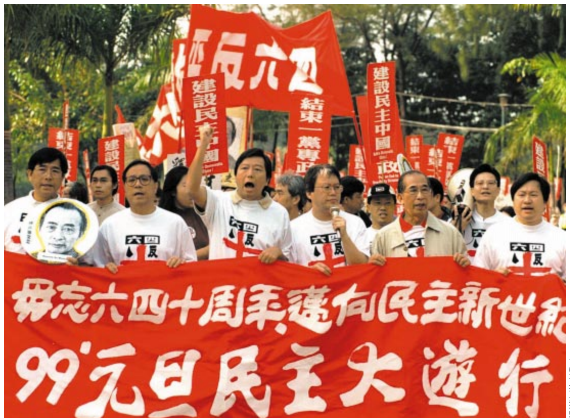
Pro-democracy and labor activists marching through the streets of Hong Kong

Democracies undeniably are capable of conducting strong foreign policies. This is especially true for wealthy democracies that can marshal large resources. Democratic policies are also marked by widespread agreement among society and government. When a consensus emerges regarding a foreign policy issue, democracies can