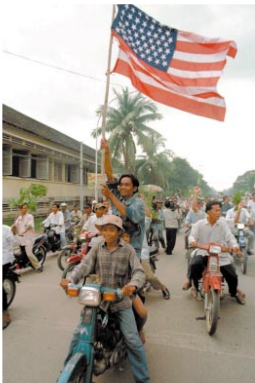
Cambodian pro-democracy demonstrators hold an American flag during a march in Phnom Penh