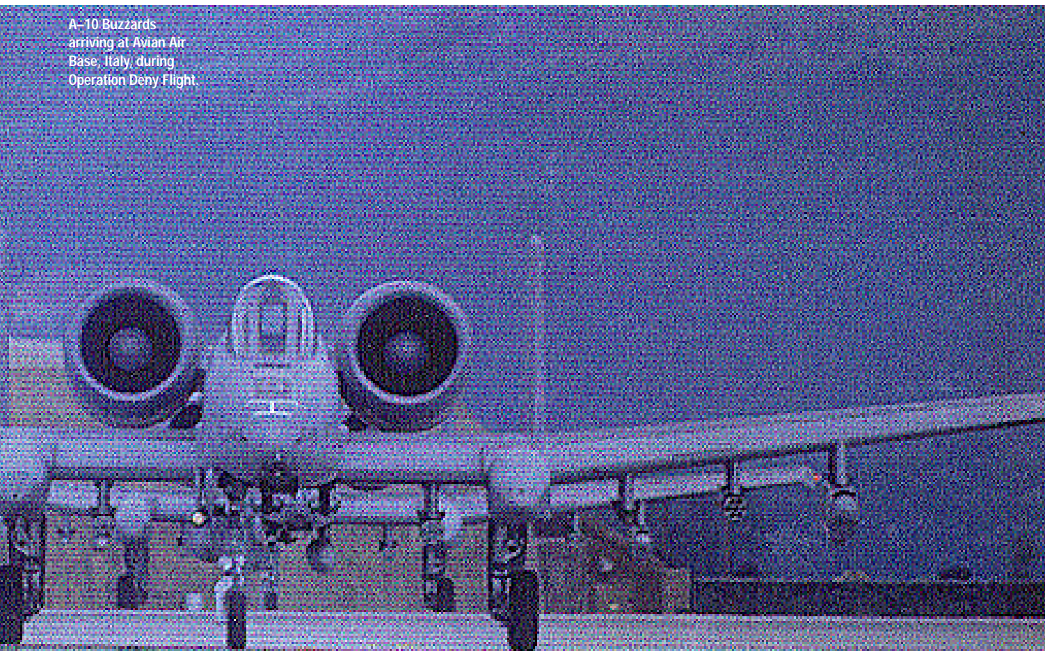
A-10 Buzzards arriving at Aviano Air Base, Italy, during Operation Deny Flight.