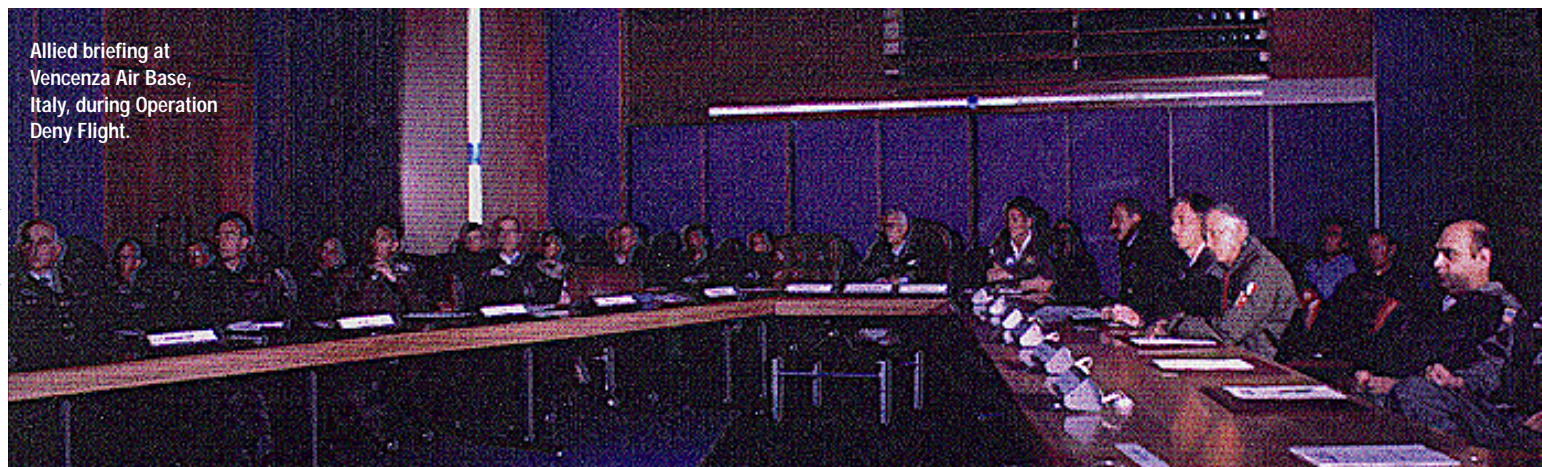
Allied briefing at Vercenza Air Base, Italy, during Operation Deny Flight.