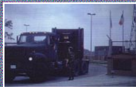
Transporting commu- nications equipment during Operation Deny Flight.