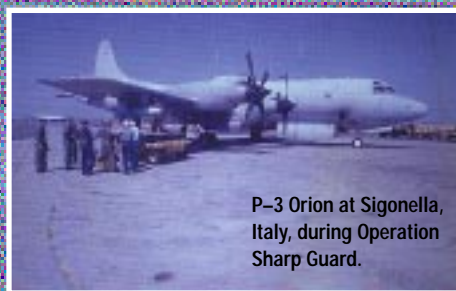
P-3 Orion at Sigonella, Italy, during Operation Sharp Guard.