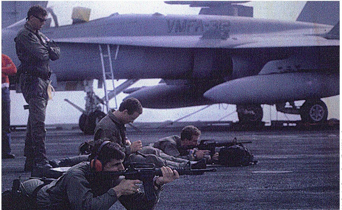
Joint Combat Camera Center (David McLeod)

east confront these difficulties. But NACC membership does not provide insurance under article 5, only assurance derived from consultation. NACC offers a vehicle for acting in concert to conduct peacekeeping operations and defuse crises in a new environment through common goals, tools, and openness in communication. Eastern and Central European nations are eagerly looking to the west for a means to enhance security in troubled, unpredictable times. NATO is listening and will step forward as the single most important forum for an emerging security architecture.