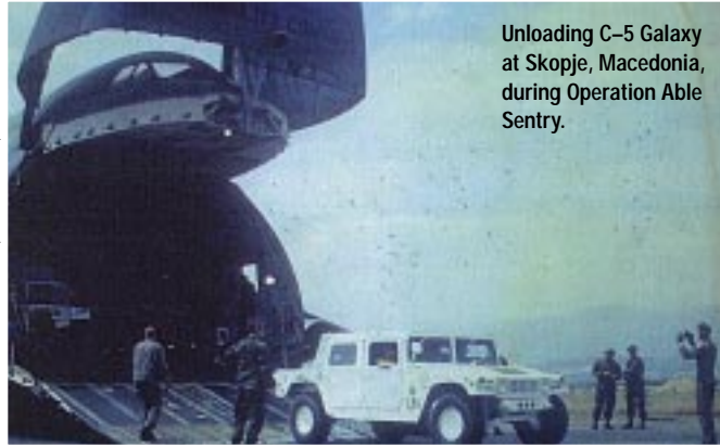
Unloading C-5 Galaxy at Skopje, Macedonia, during Operation Able Sentry.