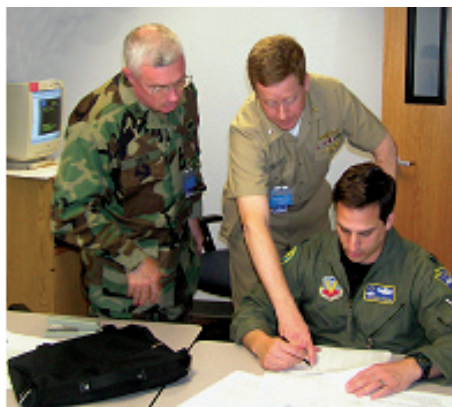
JCLASS brings together students from all Senior Level Service College

The exercise, guided by the participants' own goals and objectives, and not by scripts or the Master Scenario Event List (MSEL), challenged the students to increase their understanding of the interagency process, the elements of national power, emerging technology, transformation, and joint and combined operations in a fast-paced dynamic environment. This unique and dynamic nature of the exercise makes JCLASS one of the U.S. Army's more valuable tools in its mission