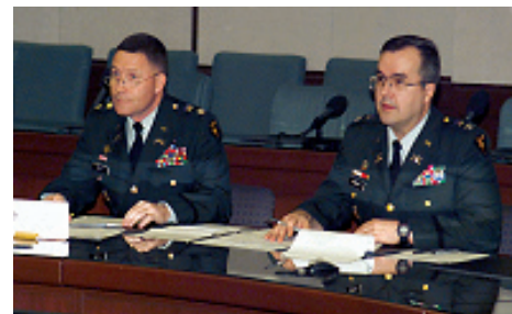
Students testify to members of Congress via VTC during SCE '04

Students work within the framework of Joint Crisis Action Planning (CAP) and interagency