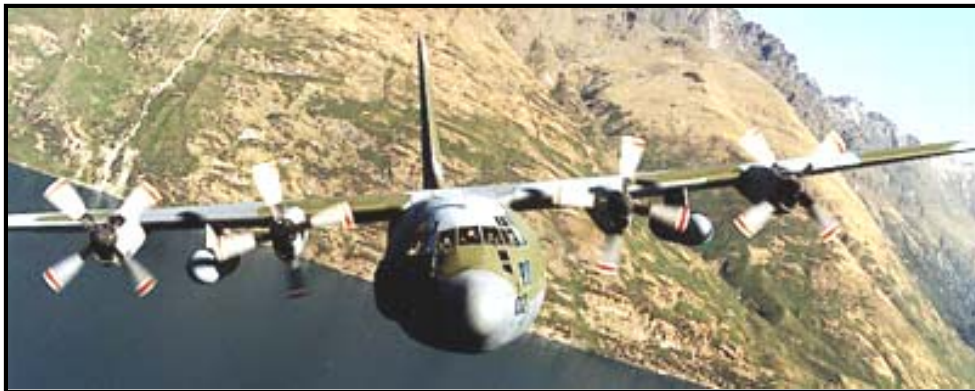
Figure 1. RNZAF C-130H over Lake Wakatipu, New Zealand

This paper is written to convince readers, particularly those from the RNZAF, that simulator training is a necessity, not a luxury. It aims to draw attention to the requirement for increased simulator exposure and presents ways of accomplishing these essential training needs. This paper is not about increasing the learning yield of current simulator sessions or redesigning the training syllabus. Nor does it infer that the RNZAF should restrict its C-130 operations because of simulator currency or training issues.