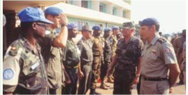
The Chairman visiting U.N. contingent.