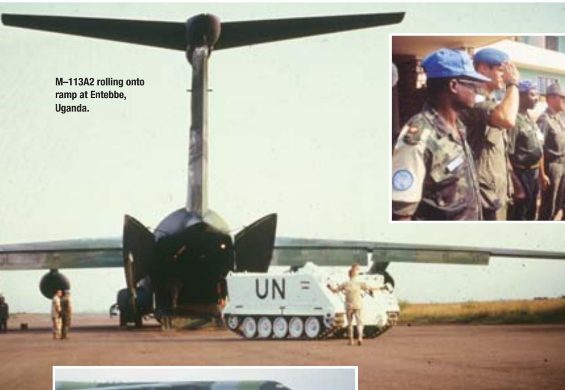
M-113A2 rolling onto ramp at Entebbe, Uganda.