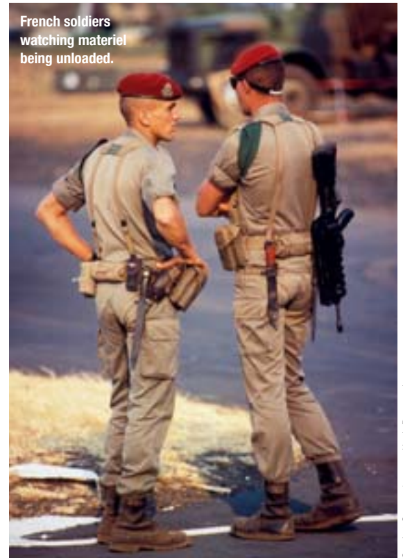
French soldiers watching materiel being unloaded.

Another example of the lack of resources was the refugee camps. There was no concerted effort by the international community to disarm refugees or segregate extremists from the general population which moved across the border into the camps. It was clear that aside from refugees in and around Goma, most refugees and certainly a majority of displaced persons in the southwest were victims of world apathy. This benign neglect was caused by the media which as a whole opted to dispatch their reporters to Goma, which helped alleviate the misery there at the expense of the rest of the country. Second, with only aid to Goma being publicized, protagonists interested in destabi-