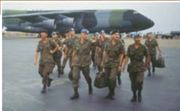
Canadians arriving via Air National Guard C-5 Galaxy.