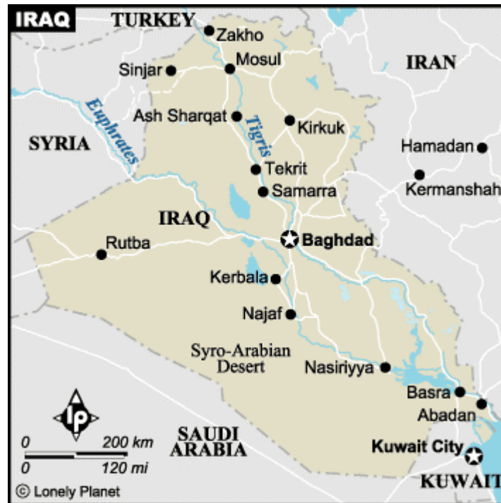
Figure 4: Map of Iraq xi

In his masterpiece On War , Carl von Clausewitz introduced the concept of the culminating point of victory. Clausewitz found that a “reduction in strength on one side can be considered as an increase on the other,” and that the concept of the culminating point was “particularly important in military theory and forms the keystone for most plans of campaign.” xli According to Clausewitz, inadequate or incomplete campaign plans cause a “reduction in strength.” After the fall of Baghdad, it became clear that coalition forces did not have a coherent plan to reconstruct Iraq’s decayed infrastructure. US Central Command’s campaign culminated on 9 April 2003. xlii