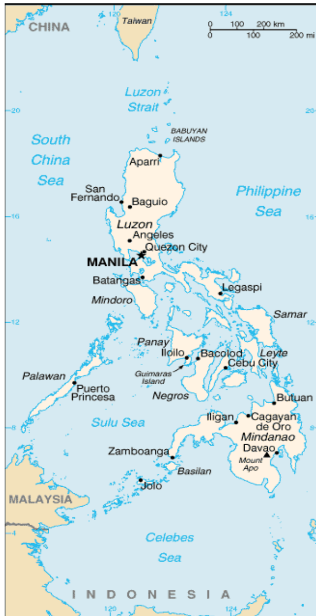
Figure 1: Map of the Philippine Islands and Basilan vi