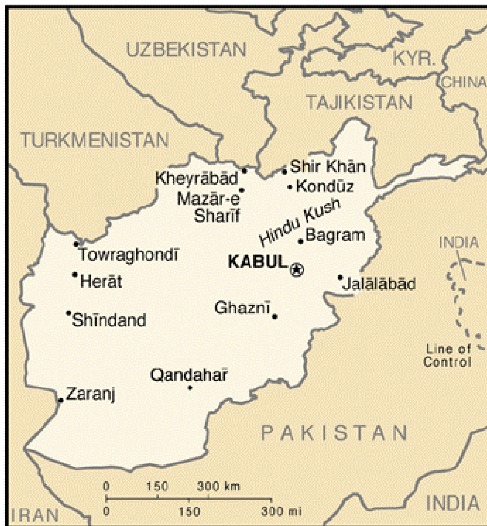
Figure 3: Map of Afghanistan xxiii

As the Combatant Commander for US Central Command, General Tommy Franks decided to capitalize on advances in teleconferencing technology to exercise operational leadership of combat operations in Afghanistan from his headquarters in Tampa, Florida. xxiv Franks' operational scheme envisioned employment of carrier- and land-based aircraft to attack targets identified by US special forces inserted to operate with anti-Taliban, "Northern Alliance" fighters then north of Mazar-i-Sharif. xxv C-17 aircraft would also provide humanitarian assistance to the Afghan people by dropping food rations. xxvi Not wanting to