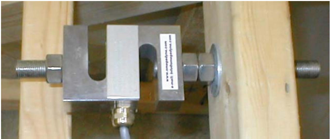
Fig 5. Top view of the load cell.

The engines burn Jet A and kerosene at the same rate; as expected, there is higher thrust (due to the higher energy release rate) from the Jet A. Thrust levels at full throttle are approximately two pounds higher with Jet A. Note that the engines do not deliver the promised 40 lb. Performance from the manufacturer. Table 1 presents the average thrust performance of three of the engines. Note the variation between engines, and also note that each engine performance was affected by ambient conditions, with some repeatability problems for hot engines versus cold-start.