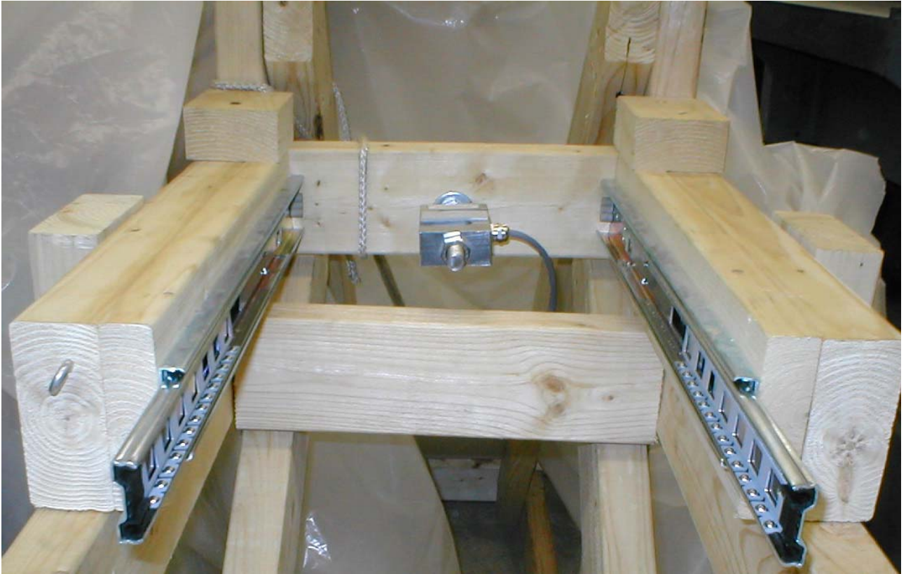
Fig 4. In-line view of the thrust bench showing sliding mechanism, as well as the load cell affixed to the end.