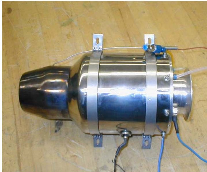
Fig. 1 AMT AT-450 Gas Turbine Engine. Unit length is 13”.

A fairly simple concept, the pack consists of four, AMT AT450 Turbine engines. Two mounted on each side of a bar parallel to the shoulders. Each engine is rated for 45 pounds of thrust at 100% throttle, though actually achieving this figure was problematical, as will be addressed later in the test analysis. The shoulder bar holding the four engines are mounted to a frame derived from a parachute harness. This frame also houses the Engine Control Units (ECU's), fuel pumps and batteries; a set of each is required per engine; and finally a collective fuel tank housing roughly thirty pounds of fuel.