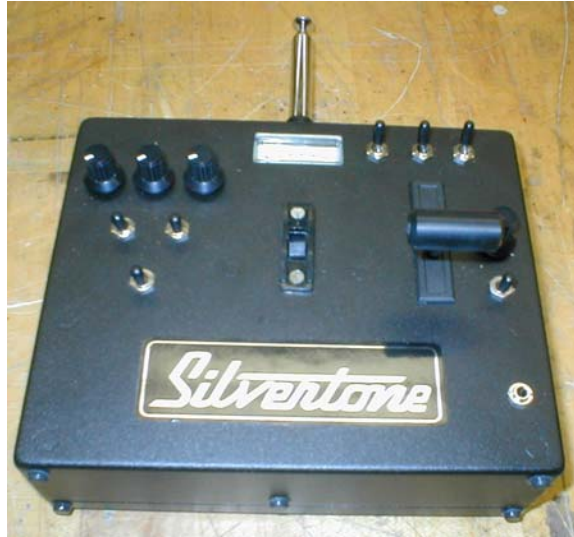
Fig. 6. Multiple Engine Controller/Transmitter

designed with the Silvertone Corp. The controller has been demonstrated with multiple engines and will eventually enable very streamlined control of all four engines via a master throttle and slave channels.