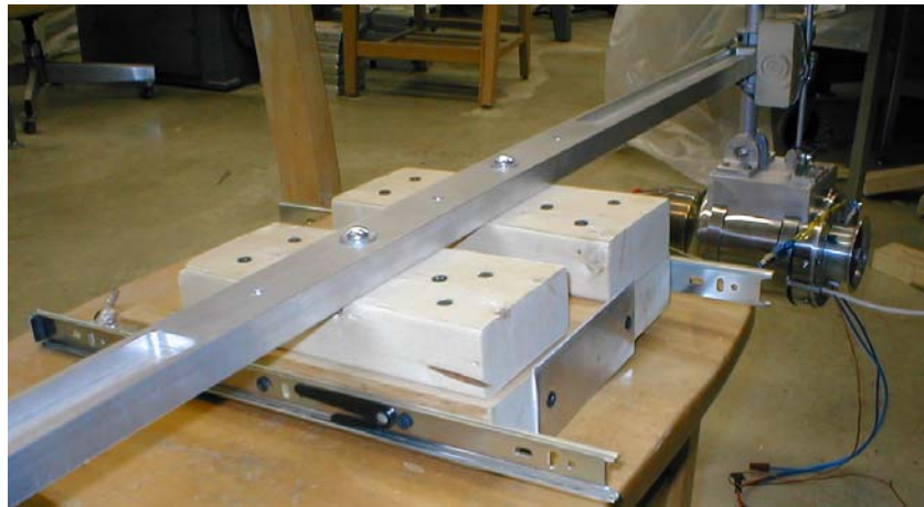
Fig. 7 Thrust stand with I-Beam mounting.