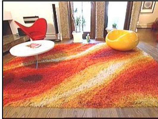
Figure4. That 70's Home: a 70's home flashback, with nice orange shag carpeting. Throw some clothing on top and you have a major obstacle to robot mobility.

the current systems in use by the Los Angeles SWAT team did not perform well in staircases. One system is a little too large to handle a winding staircase in the middle; the other unit has to be driven down the stairs backwards or it would turn turtle and require rescuing.