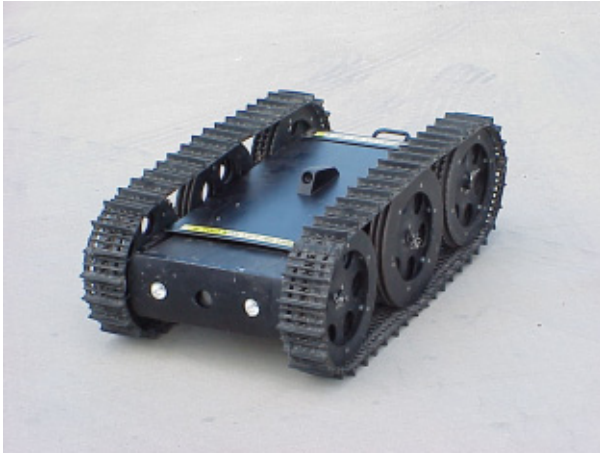
Figure 1. Front and side view of the URBOT