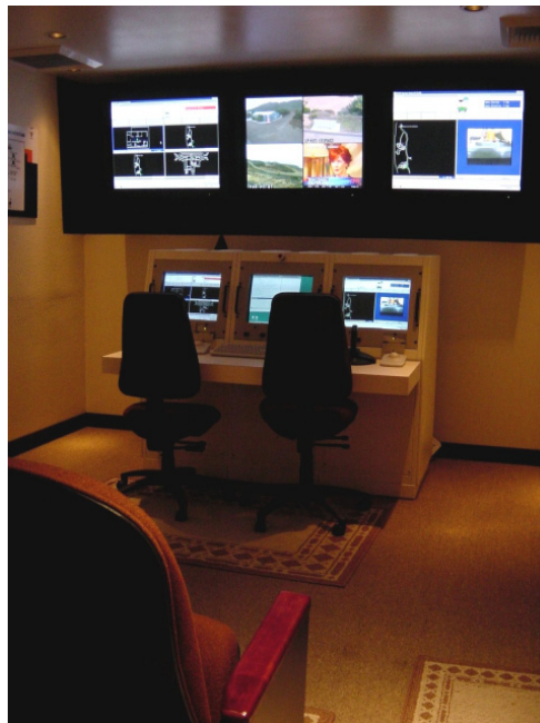
Figure 6. Robotics Operation Control Center

Many of these functions are incorporated into the URBOT. After a number of robotic demonstrations given at the SPAWAR lab to visitors, it was found that a central robotic control center would be useful. Video from up to nine robots, including the URBOT, can be displayed at once in the Robotics Operation Control Center (ROCC). Video is easily captured with the use of a small digital camera placed in the OCU for future viewing.