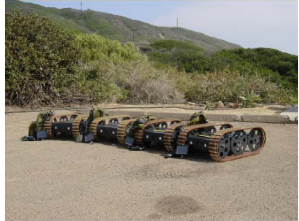
Figure 2. URBOT family