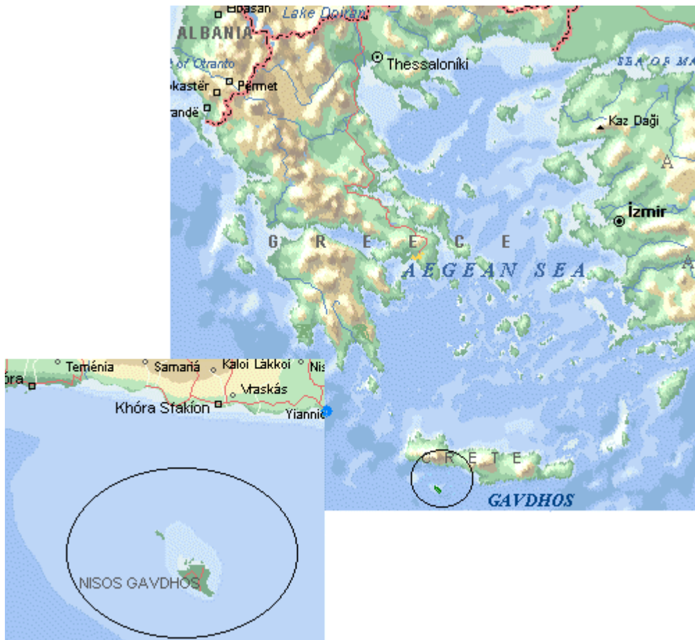
Figure 7 Gavdos island

(Figure 7), the legal status of which was defined in 1913, by the Treaty of London. 3 Greek officials argue that this pattern of behavior has become predictable.