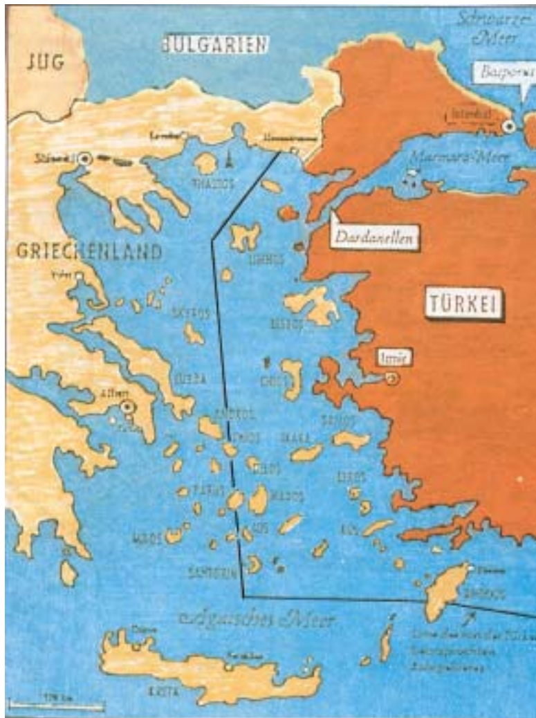
Figure 2 The limit of continental shelf claimed from Turkey

International Court of Justice (ICJ). The Security Council tried to maintain a impartial position by calling the two countries to strive to reduce tension in the area and seek a solution through negotiations. The ICJ eventually decided in January 1979 that it lacked the jurisdiction to rule on the Aegean Sea Continental Shelf case.