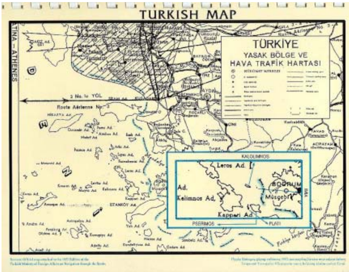
Figure 6 Turkish Map issued from the Turkish Ministry of Foreign Affairs on Navigation through the Straits (available from http://www.mfa.gr/foreign/bilateral/moremaps/imia-tr1.jpg )

Organization, and also the official Turkish map (Figure 6) included in the 1953 edition of the Turkish Ministry of Foreign Affairs on Navigation through the Straits.