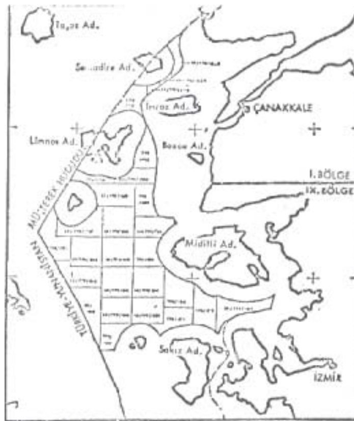
Figure 1 Map published by the Turkish Official Gazette

development 22 . However, three days later Turkey announced that a survey ship, the Candarli , was to make magneto-metric studies in the Aegean in preparation for oil drilling. The Candarli entered the Aegean on 29 May, accompanied by thirty-two warships, and made studies along the western limits of the Turkish claim. Greece protested, but Turkey rejected the protest. In addition, a month later Turkey extended her claims, extending further west and south including the waters around the Dodecanese islands (Figure 2).