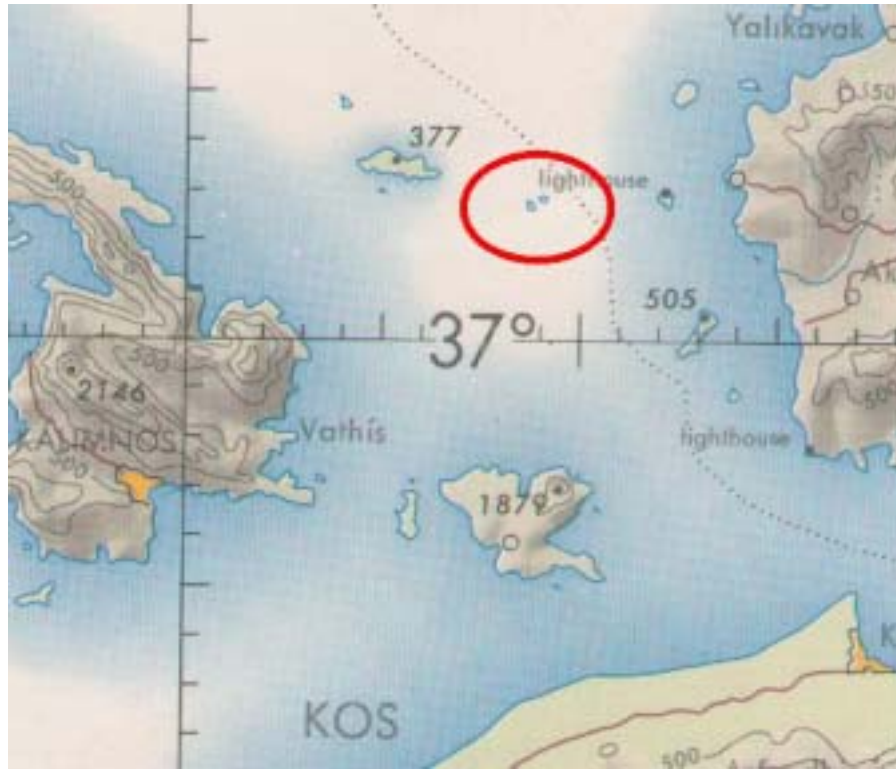
Figure 5 Imia/Kardak islets (the circle indicating the islets was added for emphasis)

1996, the Greek Embassy answered to the Turkish Ministry of Foreign Affairs rejecting the Turkish claims on the grounds that Turkey had clearly recognized the Imia/Kardak islets as belonging to Italy by virtue of a bilateral agreement concluded in 1932; the islets were subsequently ceded by Italy to Greece with the rest of the Dodecanese island chain by the Paris Peace Treaty of 1947.