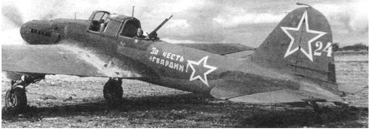
Figure4. IL-2 from 8 th Assault aviation regiment.

Не так уж много советских самолетов в годы Второй Мировой войны было сфотографировано под разными ракурсами, но этому ИЛ-2 из состава 8-го ГШАП в этом смысле повезло: его фотография также опубликована в предыдущей части (см. ИА №5/2000, с.21). На правом борте фюзеляжа самолет нес белую стрелу и надпись «За Родину!».