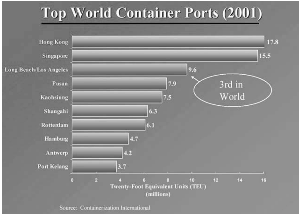
Figure 3. Top World Container Ports and Maritime Shipping Container Volume. From: Containerization International and the Transportation Research Board.

On a more global scale, the world categorizes the leading container ports as “Mega Ports.” Figure 3 illustrates the world’s leaders in container port volume, with the Port of Long Beach/ Los Angeles, CA ranking 3 rd in the world.