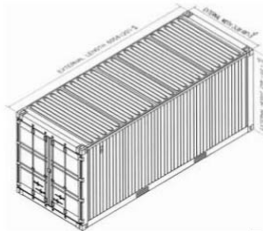
Figure 1. Standard Maritime/Intermodal Shipping Container.