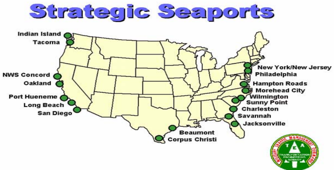
Figure 6. Strategic U.S. Seaports (January 2003). From: MTMC, Alexandria, VA.

There are currently 18 designated strategic seaports, four of which are DoD facilities primarily used for movement of arms, ammunition, and explosives. The four DoD strategic seaports are the Military Ocean Terminal Sunny Point, NC; the Military Ocean Terminal Concord, CA; the Indian Island Naval Magazine, WA; and the Naval Base Ventura County, Port Hueneme, CA. It is through these strategic seaports that DoD shipments, in ISO maritime shipping containers, are controlled, monitored, and tracked. (See Figure 6)