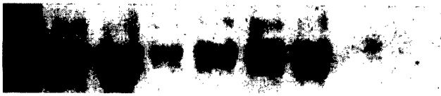
Figure 2. Immunoblot of the SRB-1 receptor in normal and cancer cell lines.

HGL5 T47D PC3 OV1063 MCF7 DU145 HeLA fibroblast