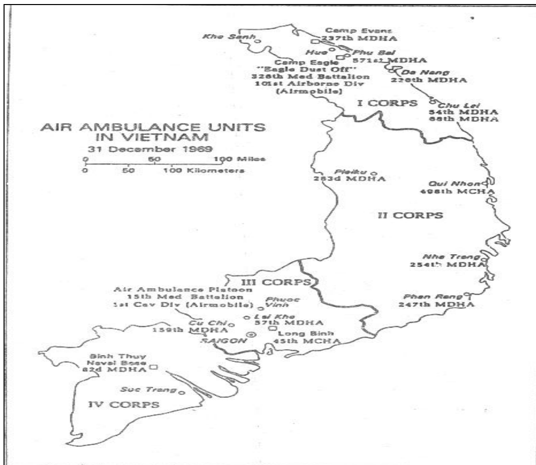
Figure 2.

Plateaus. The III Corps Zone ran from the II Corps Zone to an area forty kilometers southwest of Saigon, which included the southern foothills of the Central Highlands, a few large dry plains, and jungles along the Cambodian border. Finally, IV Corps Zone included almost the entire delta formed by the Mekong River in the southern part of Vietnam that had no forests, except for the dense mangrove swamps at the southernmost tip and forested areas just north and to the east of Saigon. 4