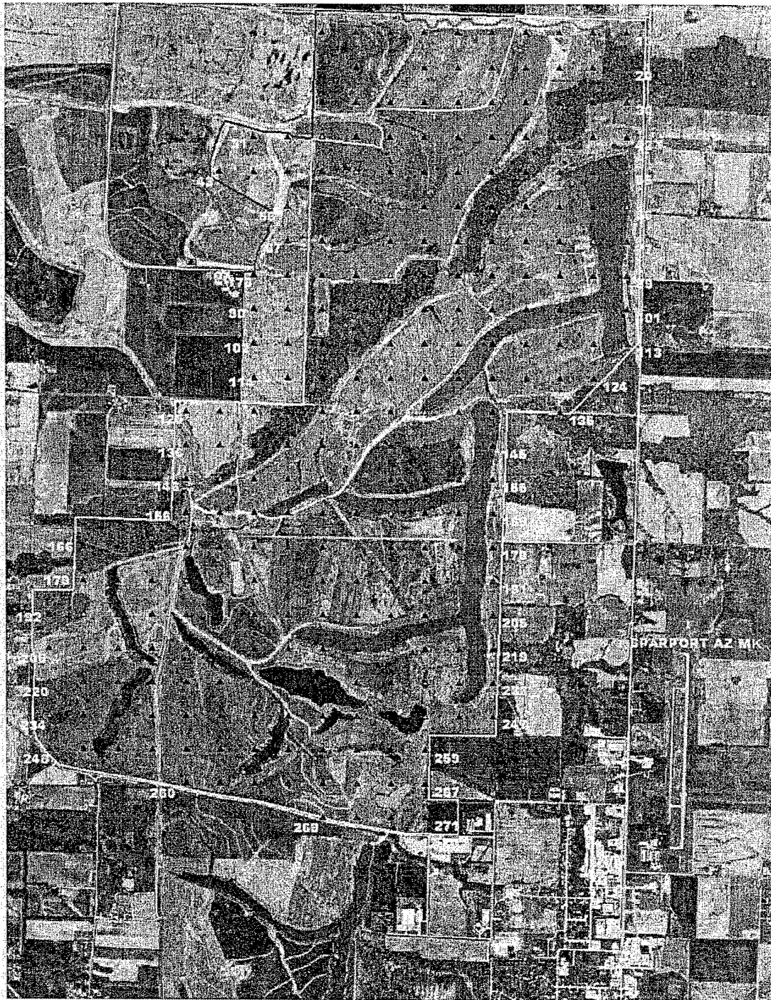
Figure 1. The sample points on an aerial photograph of the Sparta Training Area.