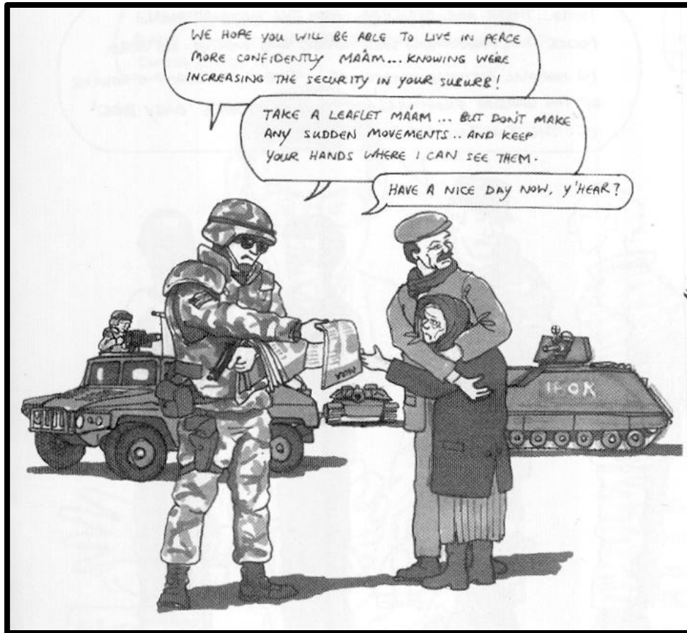
Figure 4. An Allied Impression of the US Force Protection Approachability. Source: Andy Williams, ed, The Balkans Survival Handbook, IFOR...Nema Problema!! , A collection of the “Smarter Point of View” and “Foame and Parrrts” Cartoon Series (Edinburgh: Connect, 1996).

One of the key consequences of the American FP policy was an inability to “escalate to meet the situation.” 89 The robust American approach in addition to lacking subtlety leaves no room to send subliminal messages. The altering of FP measures is a very real way to indicate a changing position as LTC Fernandez experienced in the British sector: