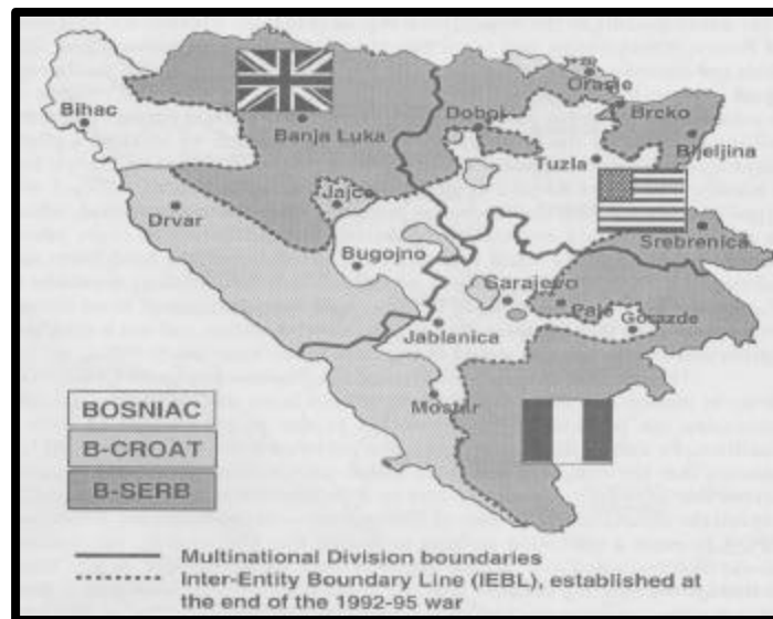
Figure 1. Bosnia-Herzegovina and the IFOR Multinational Division Boundaries. Source: David Lange, "The Role of the Political Advisor in Peacekeeping Operations," Parameters (spring 1999): 96.

US Forces played a significant role in the success of IFOR. American land forces primarily supported the operation in three locations. First, the US led Multinational Division, North (MND(N)), Task Force Eagle (TF Eagle), which was, and continues to be, responsible for the northeastern sector of Bosnia (see figure 1). This was the largest concentration of US forces and was based primarily on the US 1st Armored Division (1 AD). Second, US personnel supported the multinational headquarters in Sarajevo. Third, USAREUR and V Corps personnel supported TF Eagle from the intermediate staging base (ISB) in Hungary and from locations in Croatia. US forces also provided smaller detachments in support of the other two multinational divisions.