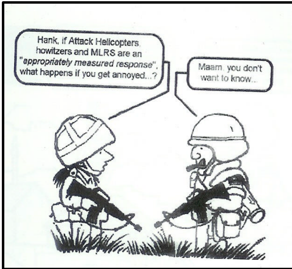
Figure 5. An Allied Impression of the US Ability to Escalate Presence. Source: Andy Williams, ed, The Balkans Survival Handbook, IFOR...Nema Problema!! , A collection of the "Smarter Point of View" and "Foame and Parris" Cartoon Series (Edinburgh: Connect, 1996).

force impotent. 96 It reinforces the perception that the policy had little to do with the threat or operational imperatives and everything to do with meeting political objectives.