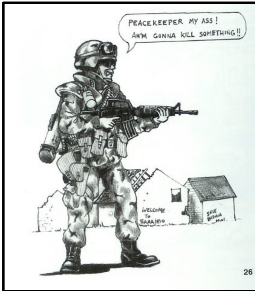
Figure 3. An Allied Impression of the US Force Protection Mindset. Source: Andy Williams, ed, The Balkans Survival Handbook, IFOR...Nema Problema! , A collection of the "Smarter Point of View" and "Foame and Parrrts" Cartoon Series (Edinburgh: Connect, 1996).

study experienced no feedback from the Bosnian population on the issue, many noted first hand comments and, on reflection, speculated on how the US approach must have been viewed. Some common Bosnian reactions were related indicating a view that US forces were overly cautious and defensive. This was tempered by a desire to maintain a