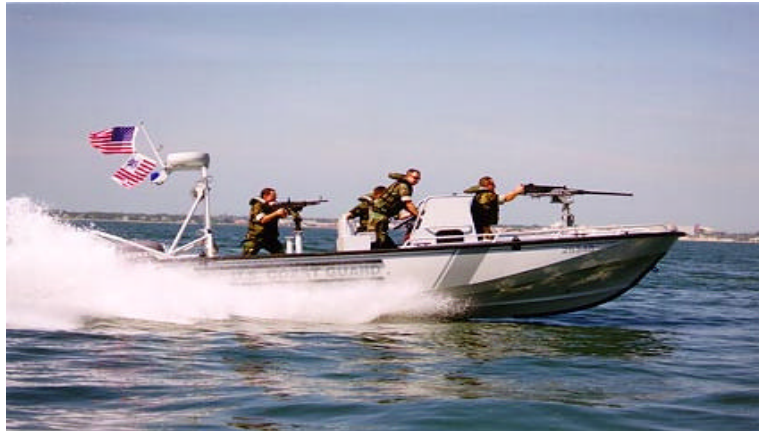
Figure 1. Transportable Port Security Boat.

assailant breach this area, PSU personnel are available to intercept and engage before the attacker can endanger the ship. Similarly, there are three waterside defense zones patrolled by the small, outboard motor powered TPSBs. The TPSBs can go outside the safety zone to escort warships coming into port. Once established, the TPSB will warn off in the safety zone, issuing warnings in both English and in the local language. Either the same or another TPSB will divert any aggressor in the security zone. This diverting can be by either simply impeding passage or using the small, powerful boat to shoulder away a would-be assailant. Depending on the threat, use of force may take place in the security zone. Finally, if an unauthorized craft should make it through the outer layers of defense into the reaction zone, the TPSB will decisively engage.