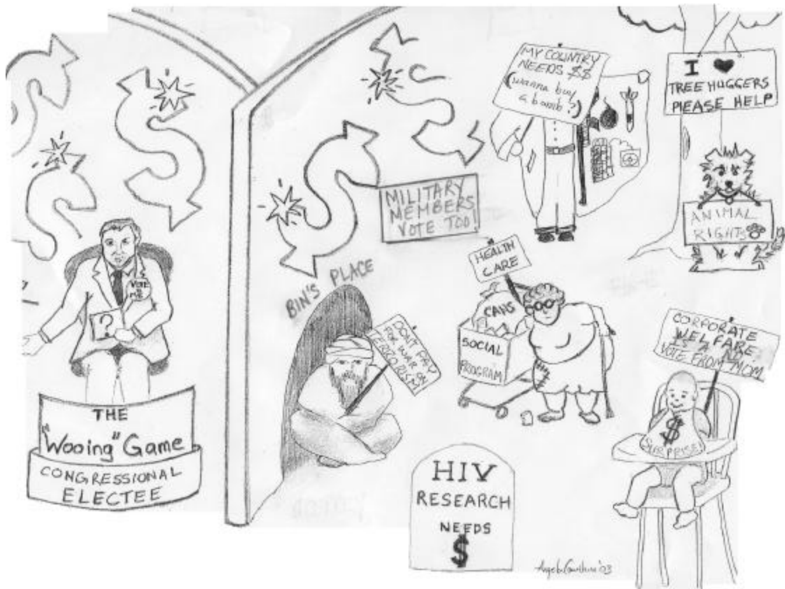
FIGURE 1 THE MANY DEMANDS FROM CONGRESS'S CONSTITUENTS

fighter jets. 17 To counter the Soviet jets, the original plans called for the Air Force to purchase 880 F-22 aircraft at a cost of 40 billion dollars. 18 However, within a few months, the price doubled to 80 billion dollars. 19 Even by historical standards this cost escalation was jaw-dropping. 20 The rising costs prompted the Pentagon to reassess the F-22 program, which led to a decision to acquire fewer F-22 aircraft. 21 Thus, the number of F-22's to be procured was reduced to 680 for 64.2 billion dollars. 22 The 1997 Quadrennial Defense Review cut the number to 339 aircraft. 23 Current estimates reflect 339 F-22 aircraft costing approximately 63 billion dollars, which is about 187 million dollars per aircraft compared to 33 million dollars to replace a F-15. 24 Moreover, as a result of the collapse of the Soviet Union, the Soviet aircraft that prompted the acquisition of the F-22, were never built. 25