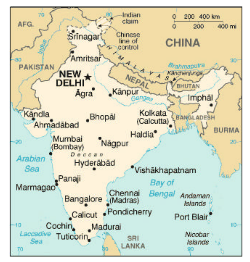
FIGURE 1. MAP OF INDIAN SUBCONTINENT

Let us first look at India's domestic concerns in regards to its neighbors and the strategic landscape in the neighboring South Asian countries (See Figure 1, Map of Indian subcontinent).