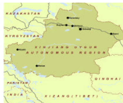
FIGURE 1. MAP OF XINJIANG 1

Xinjiang, also referred to as the Xinjiang Uyghur Autonomous Region (XUAR) occupies the northwest corner of the People's Republic of China (PRC). Encompassing more than 1,660,000 square miles, the region comprises one sixth of the PRC's landmass making it the largest in the country. Its external border stretches nearly 5,600 km and touches the borders of Afghanistan, Jammu and Kashmir, Kazakhstan, Kyrgyzstan, Mongolia,