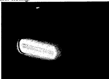
Figure 2. 2 kW Racetrack Hall Thruster firing

2, which after several modifications to the basic configuration, achieved I_{sp} = 1500 sec, 38% anode efficiency at 1.5 kW and 300 V. The nonuniform features, observable in the luminosity pattern of the discharge, with the highest luminosity in the curved portion of the racetrack are not well understood presently. Attempts to increase the local B-field in the straight section, by the addition of external coils proved unsuccessful. Possible explanations may lie on electron inertial effects, forcing a higher electron temperature in the radial region and radial variations of the B-field, that are zero in the straight portion. Busek has a significant amount of design and test experience in the range of 600 W to 8 kW that gives us experimental data for comparison. At the conclusion of this program the 5kW racetrack thruster will be delivered to the AFRL for further testing.