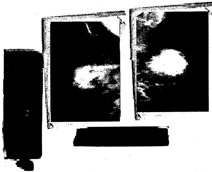
Figure 2. An Initial System Configuration

Dr. Ahmed Jendoubi is taking the lead to develop a research workstation for mammography. The initial system configuration is shown in Figure 2 and its detailed system components are given below.