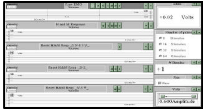
Figure 3. User interface of the developed ENMG system.

The findings in this study support the idea that the H-reflex and M-response in the FCR muscle have a fairly constant latency and amplitude during a prolonged isometric contraction and the H_{max}/M_{max} would not significantly ( \alpha=0.05 ) change in a given person on repeated testing on different days and hence could be used as an invariant and reliable measure of ENMG activity. It is important to mention that the observed variability is a combined result of subject response variability (which constitutes the bulk of the variability) and to a much smaller extent the equipment variability including electrode positioning, skin preparation, etc.