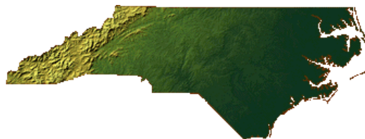
(UNCLASSIFIED sample—for training purposes only)