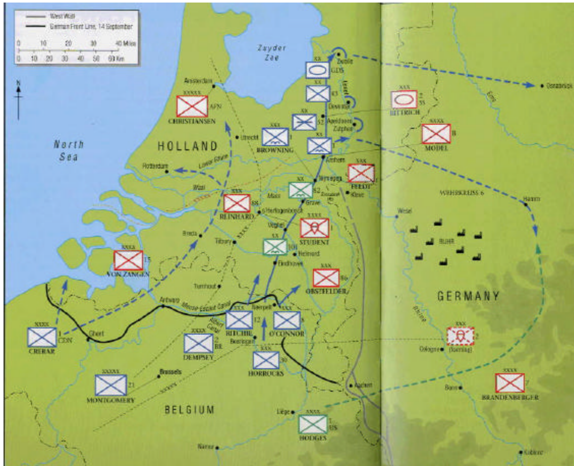
Figure 1. Operation Market-Garden Plan.