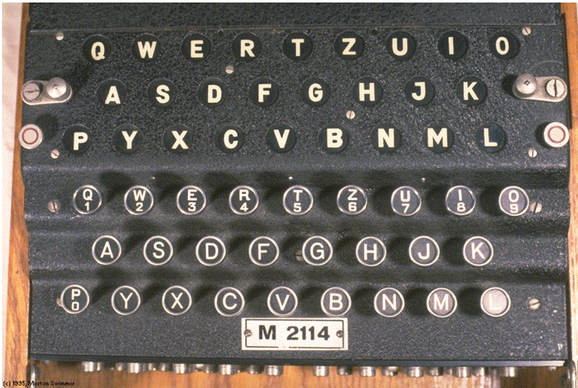
Figure 2. Enigma Keyboard.

The operating instructions would tell all of the operators working on that particular network how to configure their machine for a specific time period, generally twenty-four hours. Only Enigma machines with the exact configuration would be able to decipher the sent message. As mentioned earlier, each service had its own version of the Enigma and likewise its own operating settings. The challenge for the Allies was that just