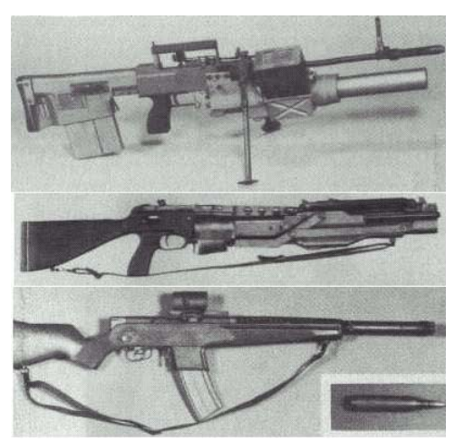
Figure 2-1, Prototype SPIWS From top: Springfield Armory, AAI Corp (2) [After Ezell 1984]

In 1963, the DoD announced the purchase of the AR15 as an interim measure. Meanwhile, the follow-on to the LWR was the Special Purpose Individual Weapon (SPIW) program. This effort pursued the possibility of a small caliber "flechette"<sup>1</sup> round for use in a military rifle. After extensive development and testing, no SPIW prototypes could attain reliability, durability and weight requirements. In 1966, the Army