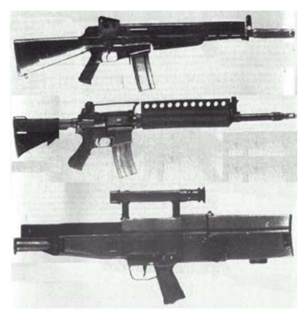
Figure 2-2 Prototype ACRs From Top: AAI Corp, Colt Ind., Heckler and Koch [After Hogg as cited in Velleux, 2001]

Concurrently and as a result of NATO munitions standardization, requirements developed by the Marine Corps and the United States Army Infantry Center, Ft Benning, GA (USAIC) led to the development of the M16A2. M16A2 improvements included a redesigned barrel to support firing a heavier projectile, improved sights and integral provisions for left-handed firers. Due to munitions and weapon enhancements, the rifle's range increased to 800 meters from 300 meters.